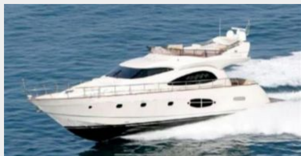
WhatsApp Image 2021-05-11 at 10.09.32