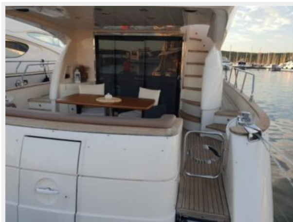
WhatsApp Image 2021-05-11 at 10.09.05 (1)