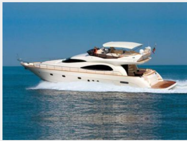
WhatsApp Image 2021-05-11 at 10.10.42