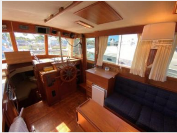
Salon Looking Starboard