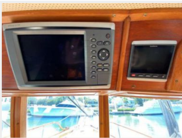
Garmin Navigation and Auto Pilot