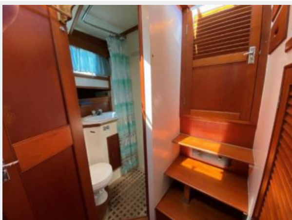
Forward Stateroom Head