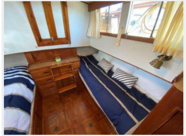
Aft Stateroom Looking Port