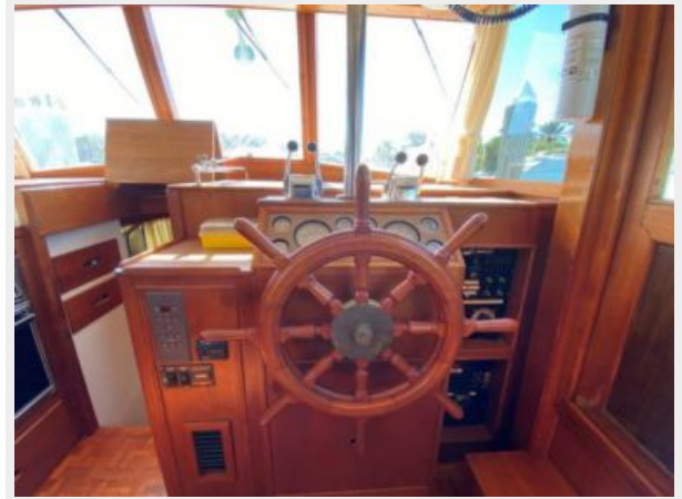
Lower Helm Wheel