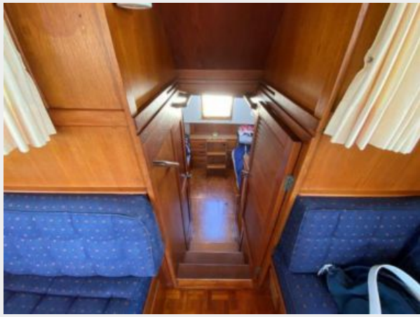
Access to Aft Stateroom