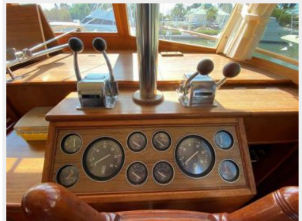
Lower Helm Display