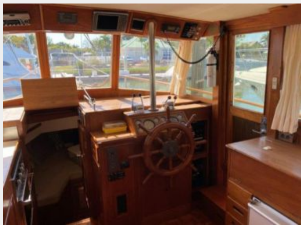
Lower Helm Station