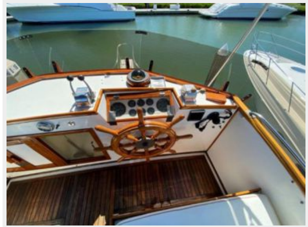
Upper Helm Station