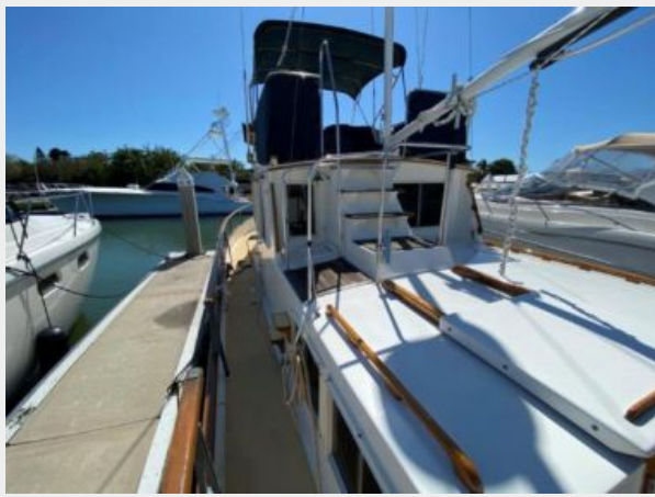
Transom looking Starboard