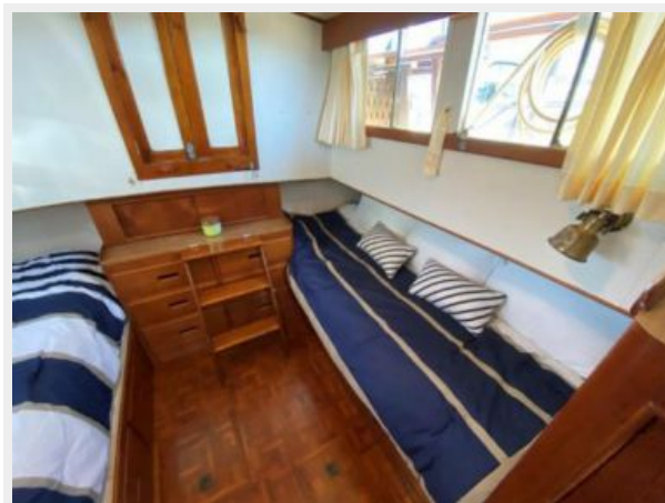
Aft Stateroom Looking Port