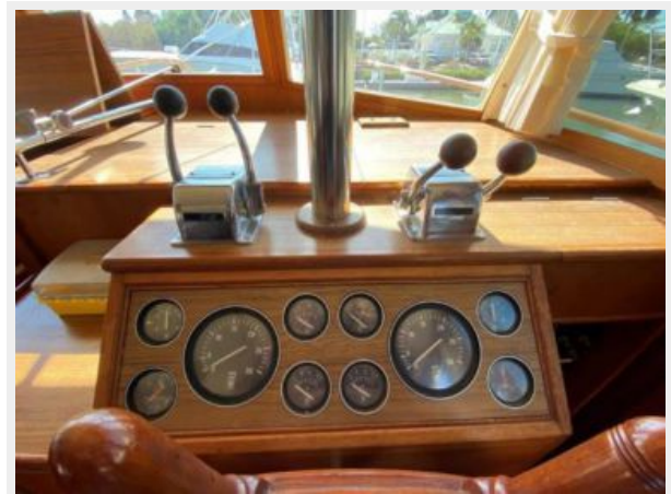
Lower Helm Display