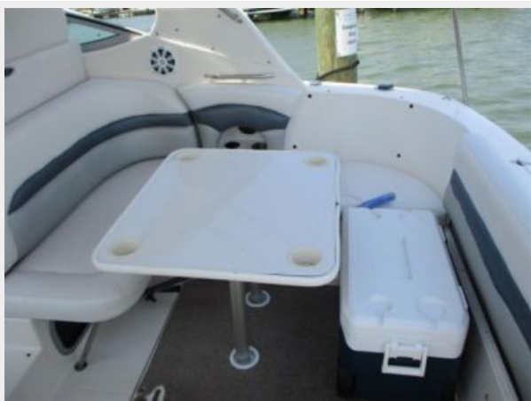
21. Aft Lounge To Starboard