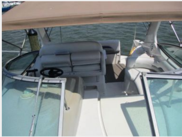
13. Deck View Aft