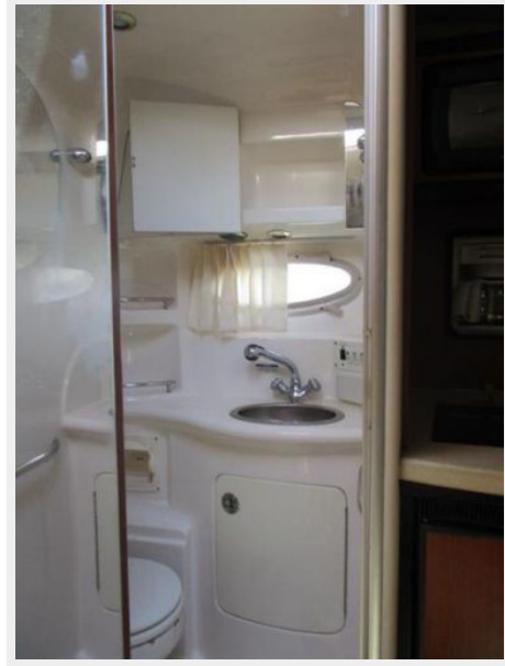
26. Head, Shower & Sink