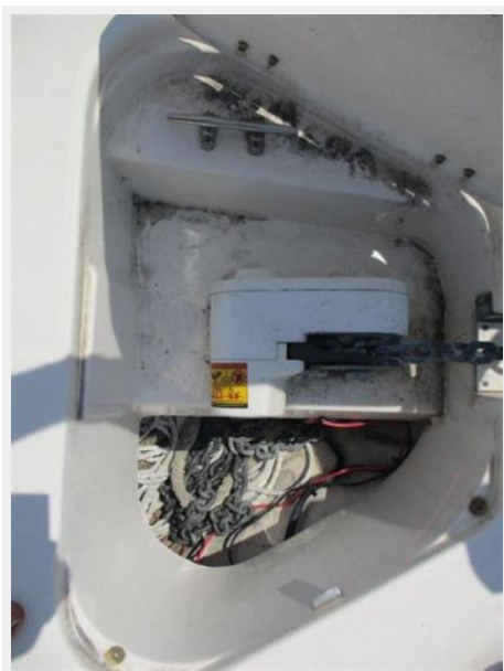
11. Windlass Anchor Hatch