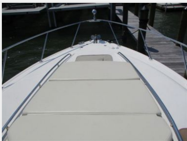
9. Deck View Forward