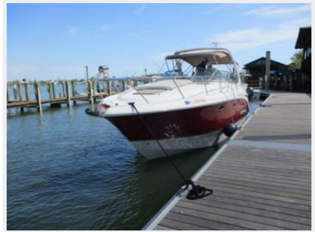
2.Bow Profile Pic