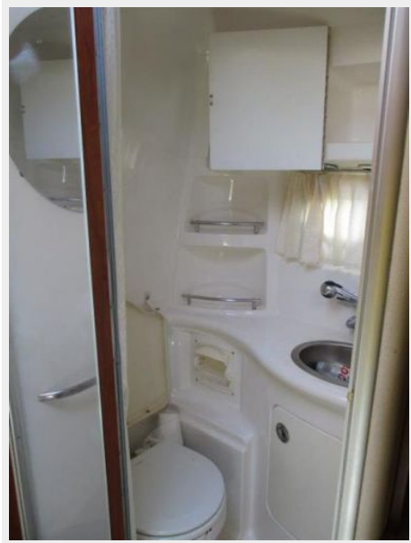
27. Head 2