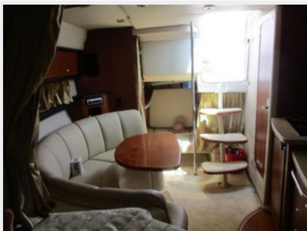
31. Forward Berth View Aft 2