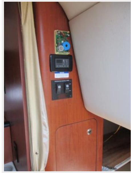
36. CO 2 Alarm, Genset Start