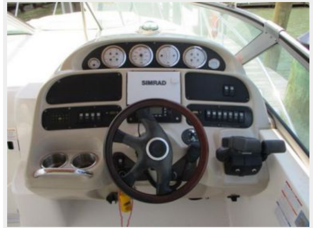
14. Helm View 1