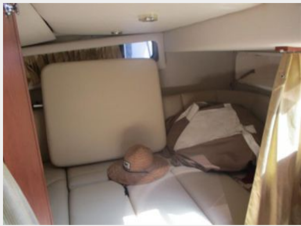
35. Midship Double Berth