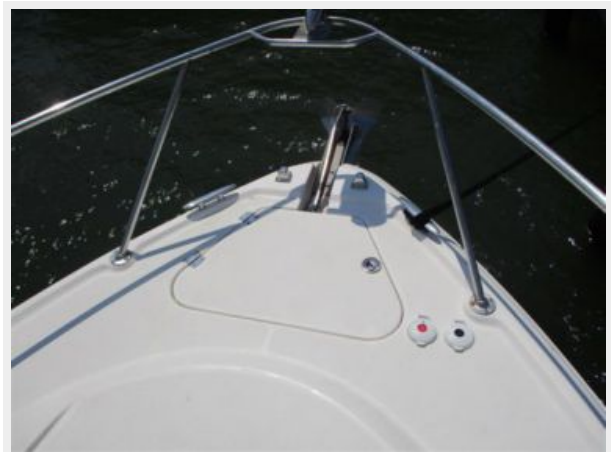
10. Windlass & Anchor