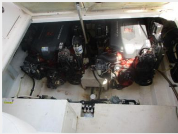
37. Volvo 5.7l Engines