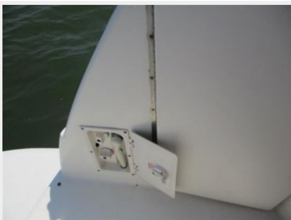
23. Aft Shower Port & Transom Door