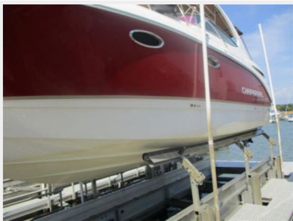
5. Starboard Profile Dry