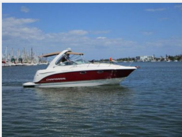
3. Starboard Profile Pic