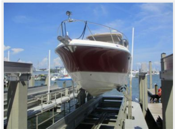
4. Bow & Hull Profile Dry