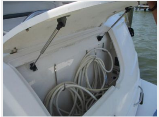
20.30 Amp Power Cord & Storage Aft