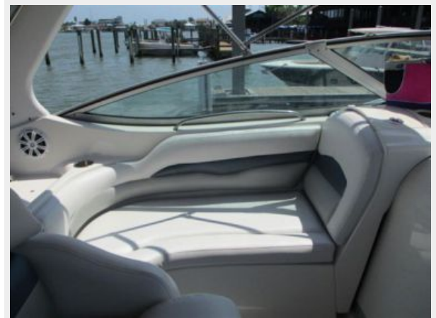
16. Lounge Seat To Port