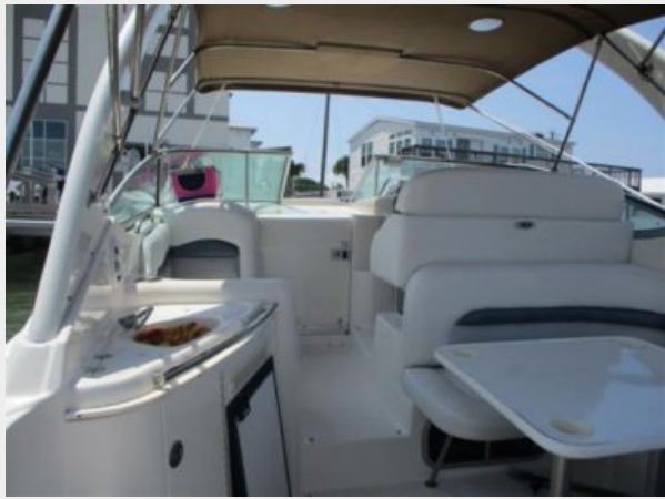
19. Aft View Forward 2