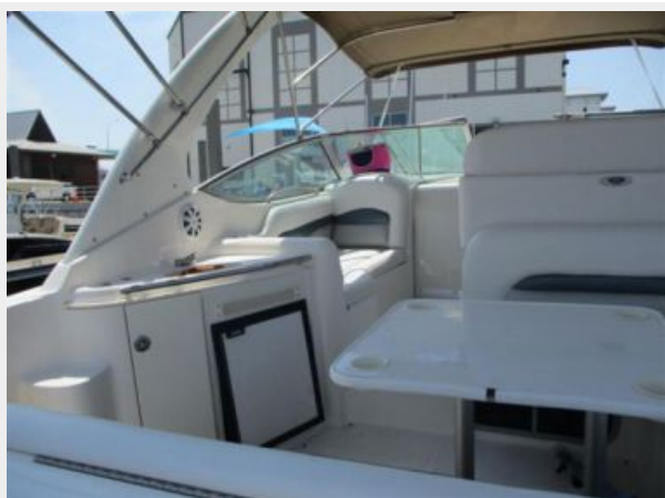
17. Aft View Wet Bar To Port