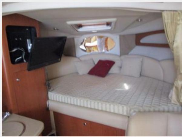
29. Forward Berth & Flatscreen t.v.