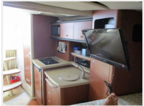
30. Forward Berth View Aft