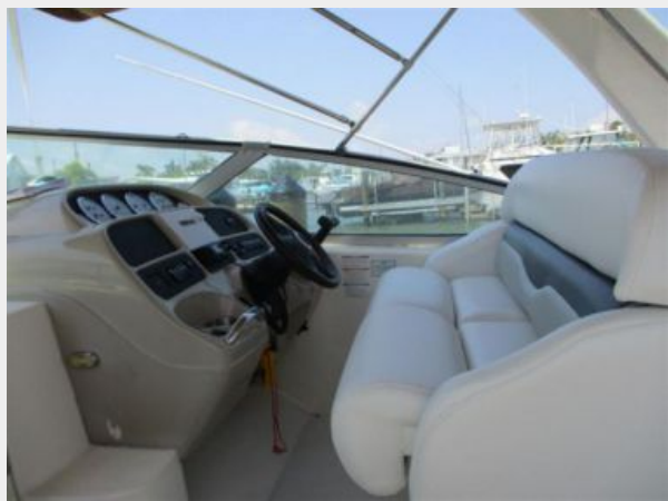
15. Helm View 2