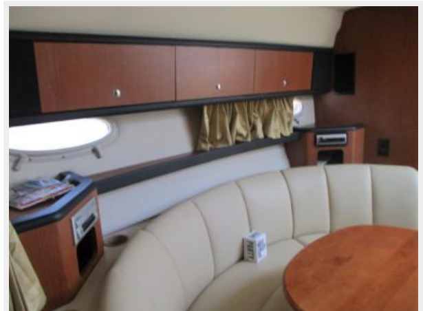
32. Starboard Settee, Storage cabinets