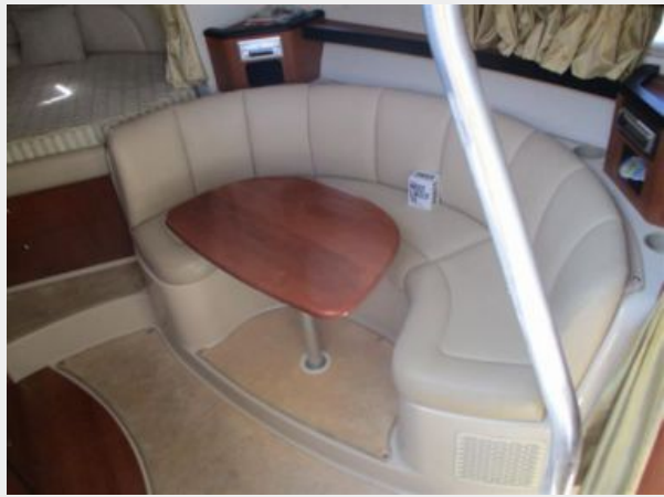
25. Salon Settee To Starboard