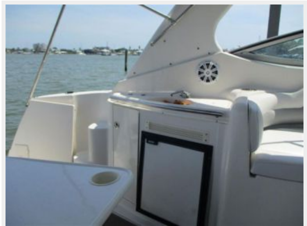
22. Wetbar & Refrigerator