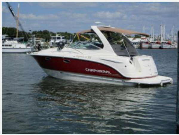
1.Port Profile Pic