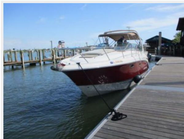
2.Bow Profile Pic