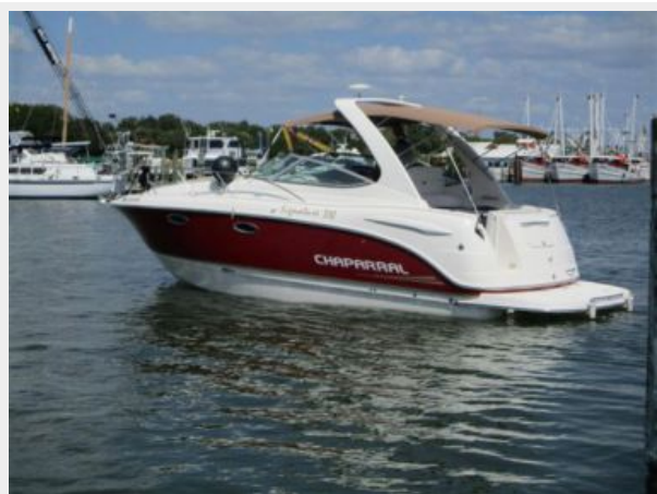
1.Port Profile Pic