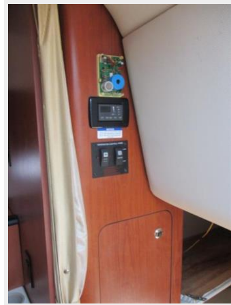
36. CO 2 Alarm, Genset Start