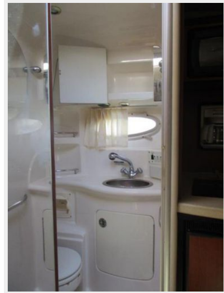
26. Head, Shower & Sink