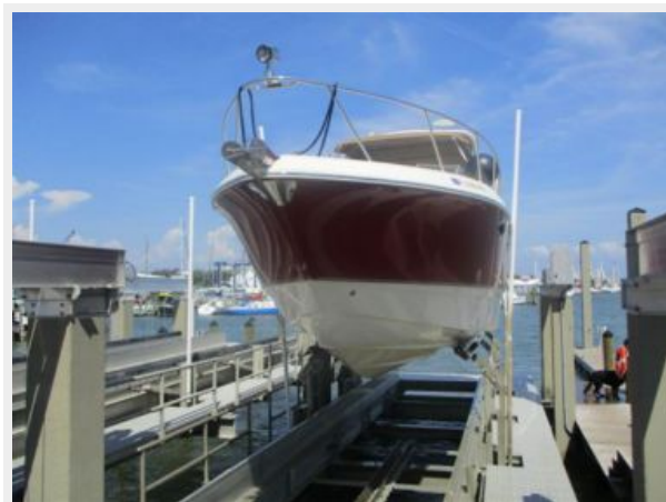
4. Bow & Hull Profile Dry