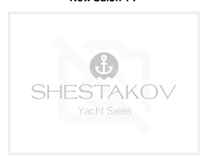
New Salon TV