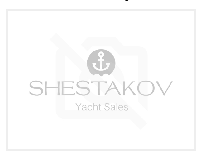
Master Looking Aft