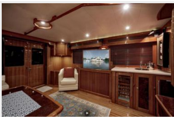
Salon Port Side