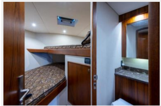
54' 2011 Ritchie Howell Express Sportfish Yacht WILDCATTER