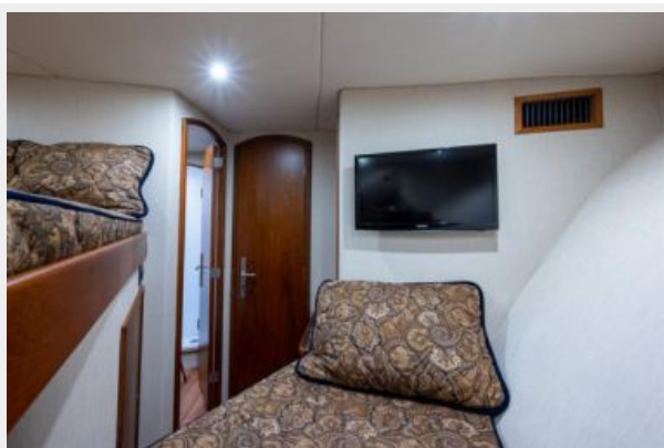
54' 2011 Ritchie Howell Express Sportfish Yacht WILDCATTER