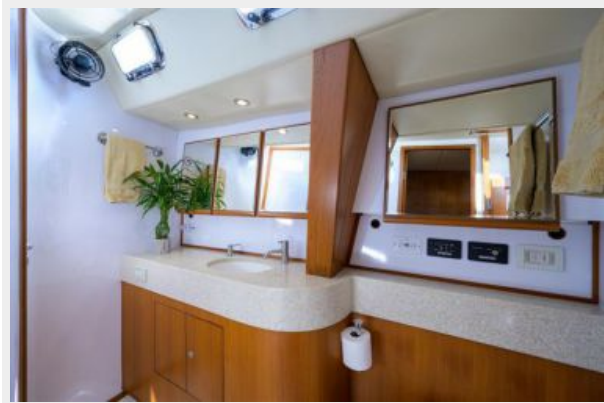
Forward Guest Head