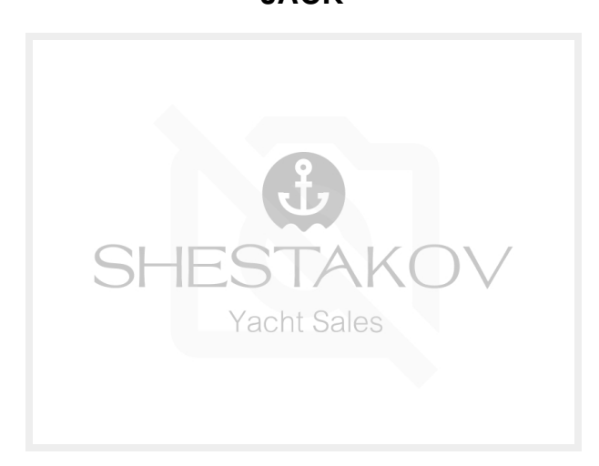
43' 2019 Formula SSC Sport Cruiser SEA JACK