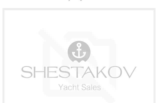
43' 2019 Formula SSC Sport Cruiser SEA JACK