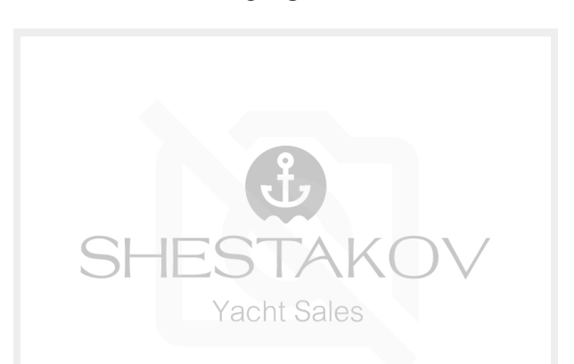
43' 2019 Formula SSC Sport Cruiser SEA JACK