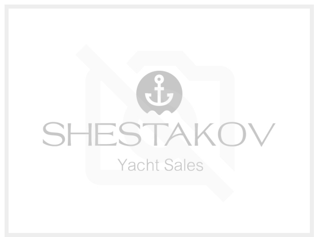
15 Deck Locker