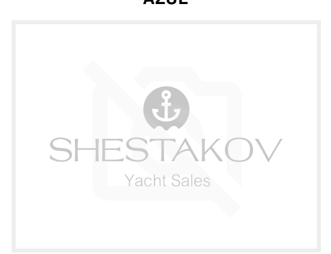
55' 2003 Hatteras Sportfish Yacht GRAND AZUL