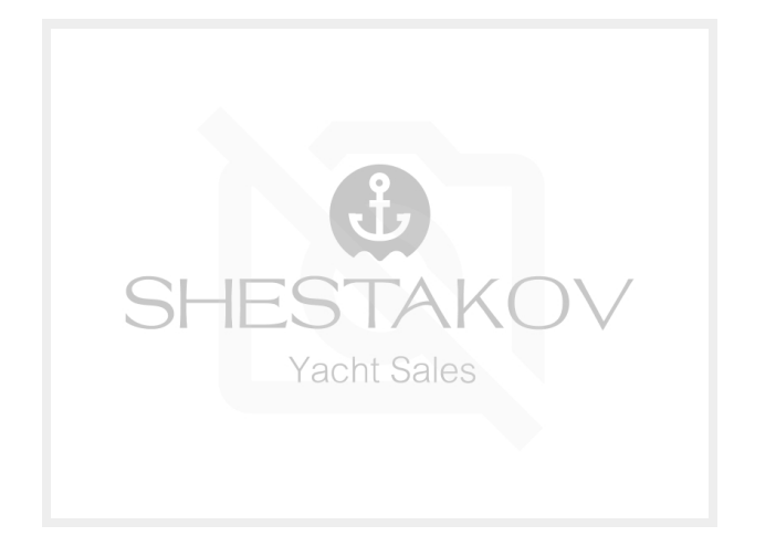
SHESTAKOV Yacht Sales