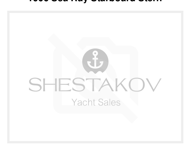
1006 Sea Ray Starboard Stern