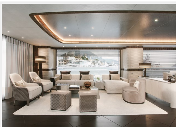
Dynamiq G500 int1