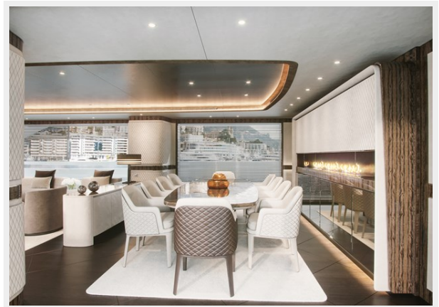
Dynamiq G500 int6