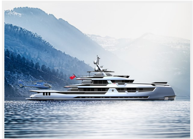
Dynamiq G500 002