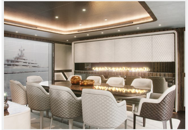
Dynamiq G500 int10