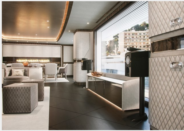
Dynamiq G500 int9