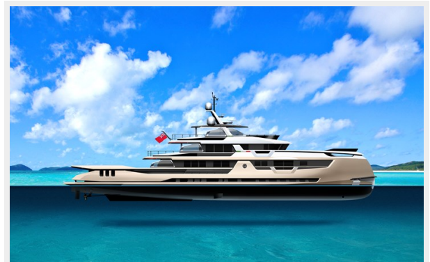
Dynamiq G500 004