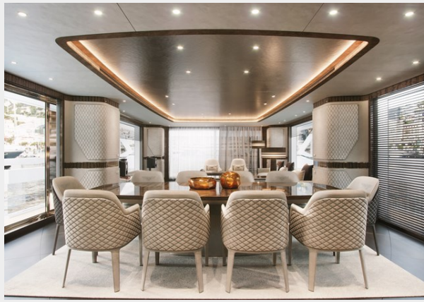
Dynamiq G500 int3