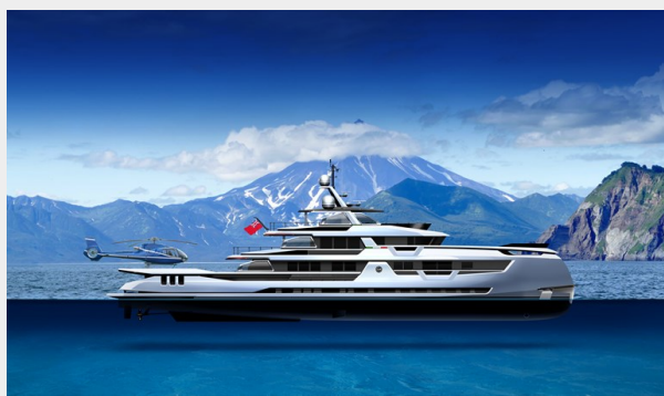
Dynamiq G500 003