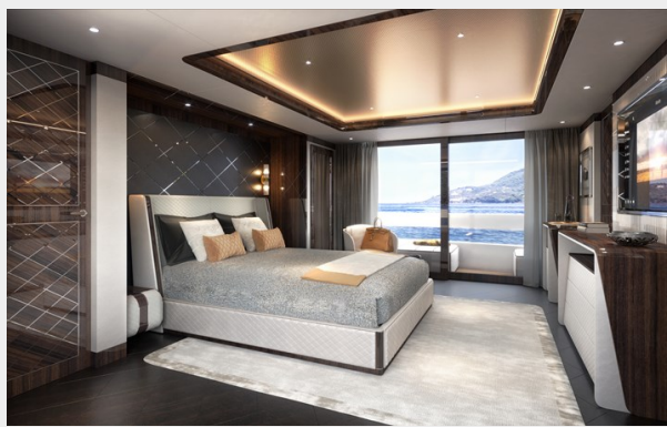
Dynamiq G500 int11