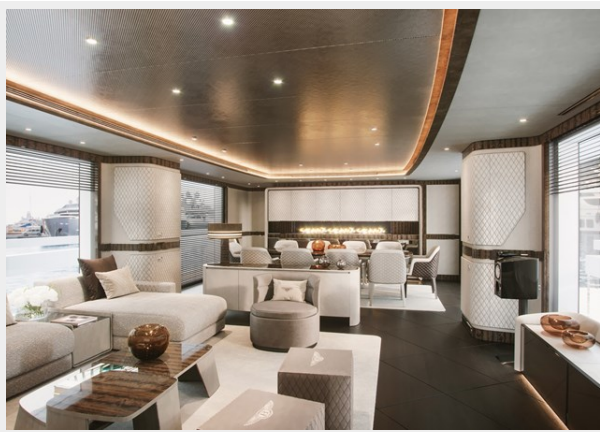
Dynamiq G500 int5