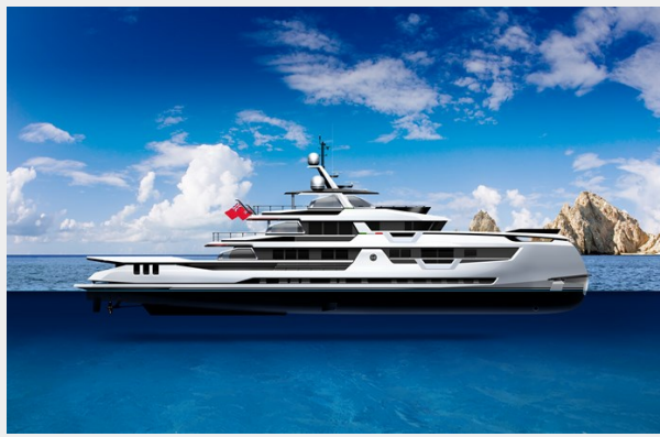
Dynamiq G500 001