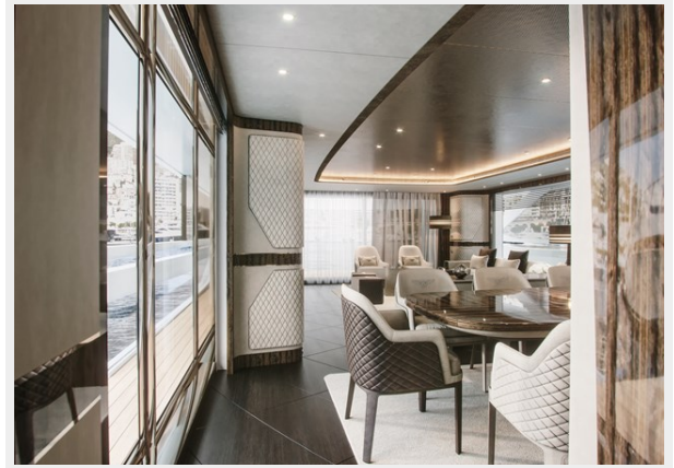
Dynamiq G500 int4