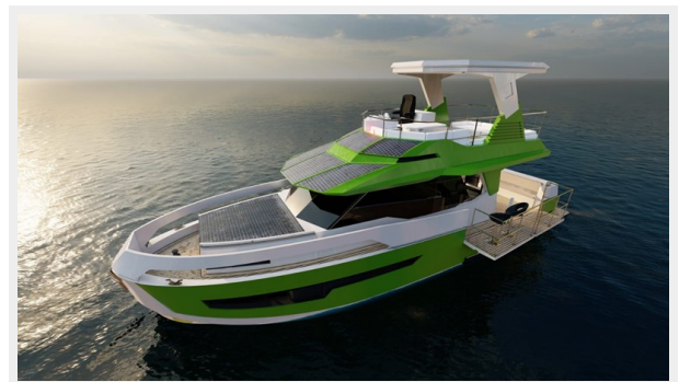
GN47 Green Zoom