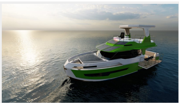
GN47 Green Portside