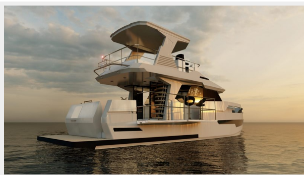
GN47 White Starboardside