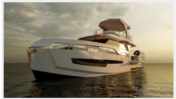
GN47 White Waterline