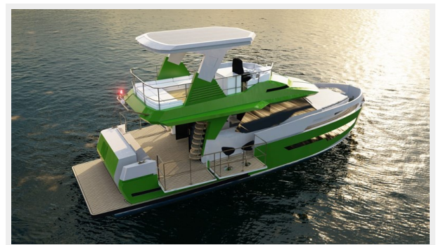
GN47 Green Tall