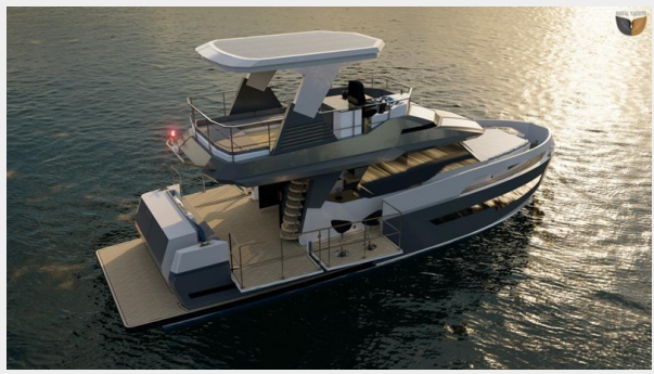
GN47 Brown Tall