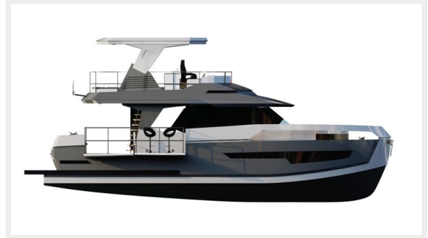
GN47 Brown Plain