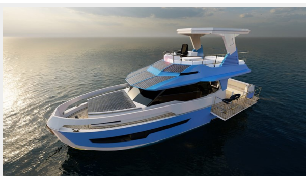
GN47 Blue Zoom