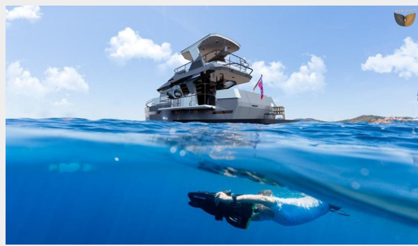
GN47 Brown Diver