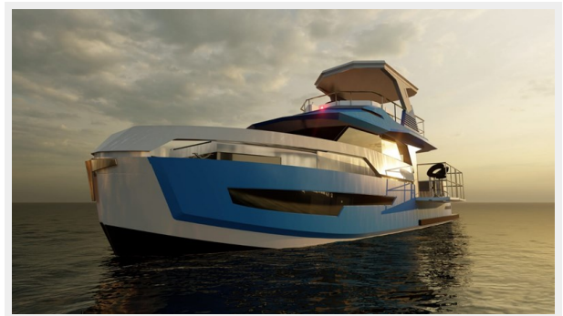
GN47 Blue Waterline