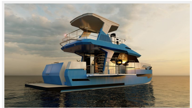
GN47 Blue Starboardside