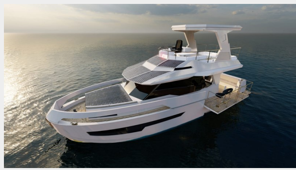
GN47 White Zoom