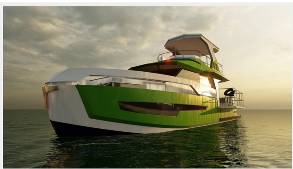
Gn47 Green Waterline