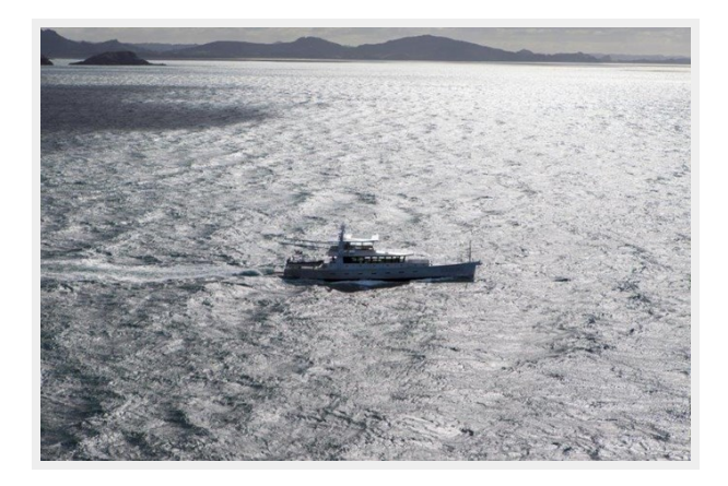
This Boat Catches Fish!