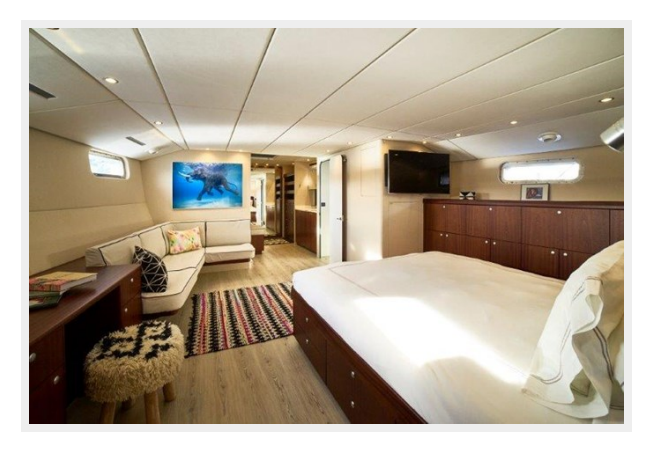
MASTER LOOKING FORWARD