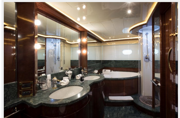
Seraph © StuartPearce L23