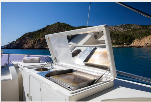
Seraph © StuartPearce L44