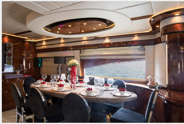
Seraph L18