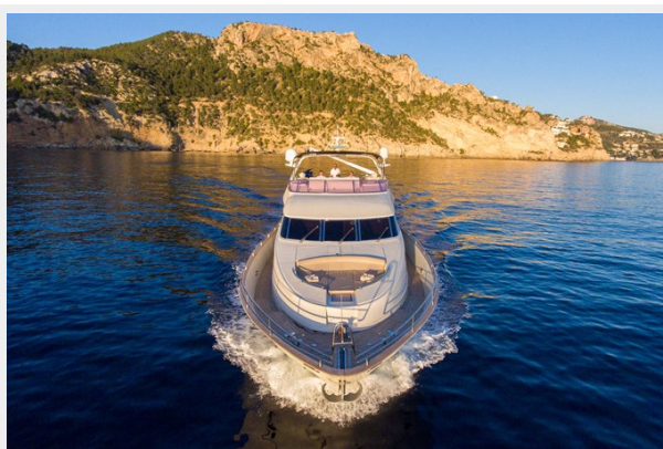
Seraph © StuartPearce L57