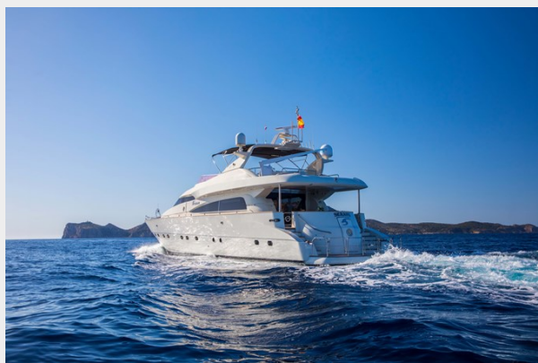
Seraph © StuartPearce L04