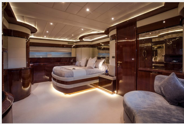
Seraph © StuartPearce L20