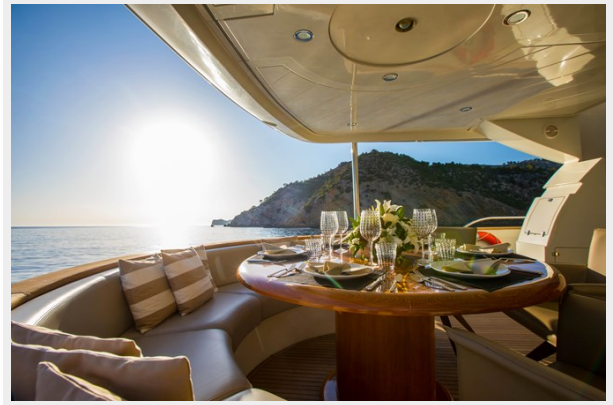
Seraph © StuartPearce L49