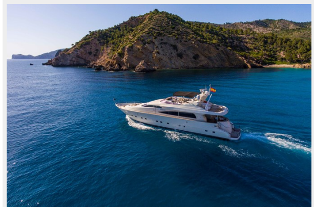
Seraph L11