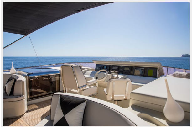
Seraph © StuartPearce L45