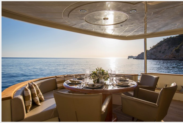
Seraph L48