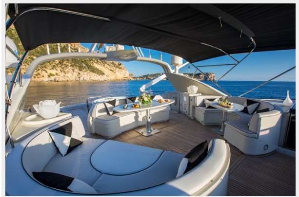
Seraph © StuartPearce L51