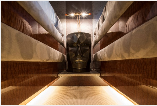
Seraph © StuartPearce L35