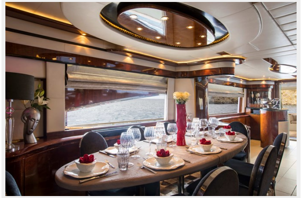
Seraph L19