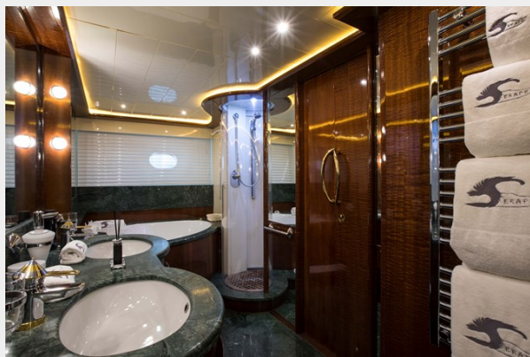
Seraph © StuartPearce L22