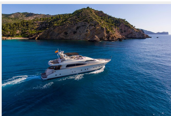
Seraph L11 retournée