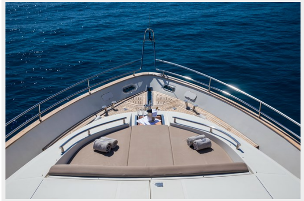
Seraph L42