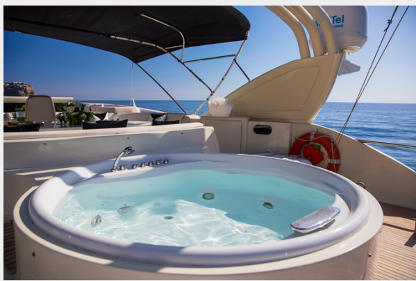
Seraph © StuartPearce L46