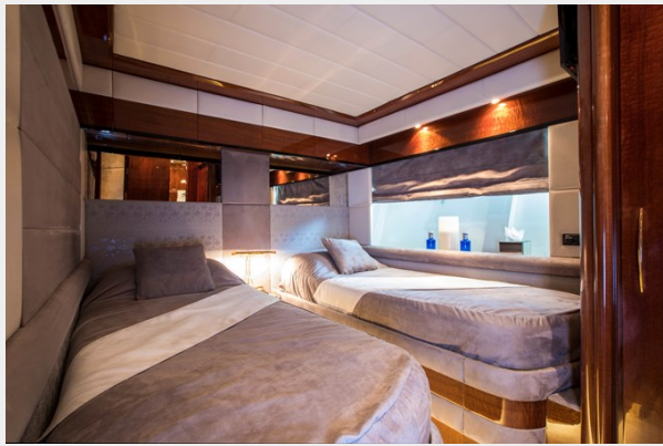
Seraph © StuartPearce L25