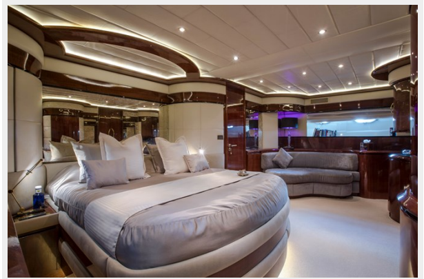
Seraph © StuartPearce L21