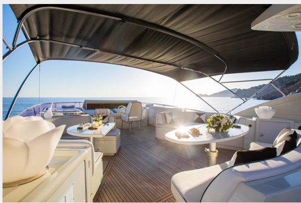
Seraph L54