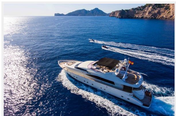
Seraph © StuartPearce L12