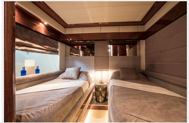
Seraph © StuartPearce L33