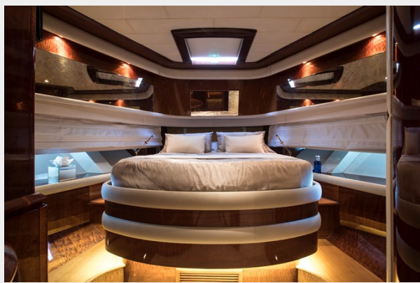
Seraph © StuartPearce L28