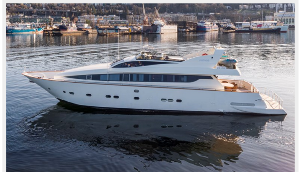
WW Air 17L