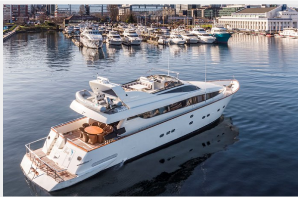
WW Air 03L