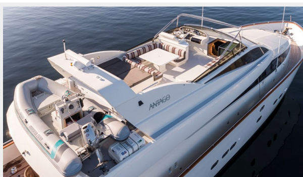
WW Air 05L