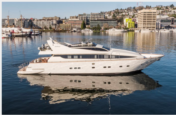
WW Air 09L