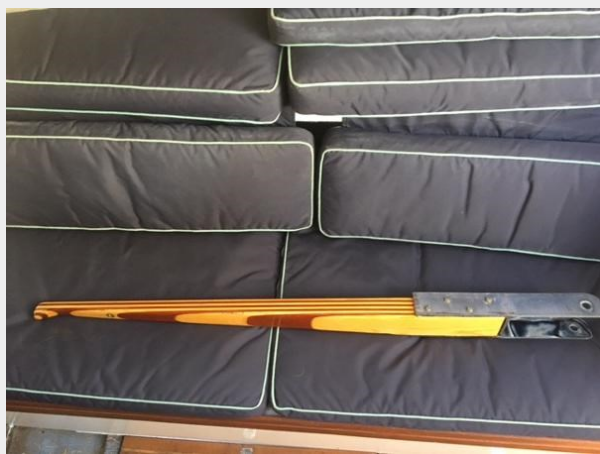
Pursuit Cushions 1