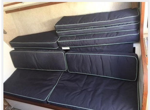
Pursuit Cushions 2