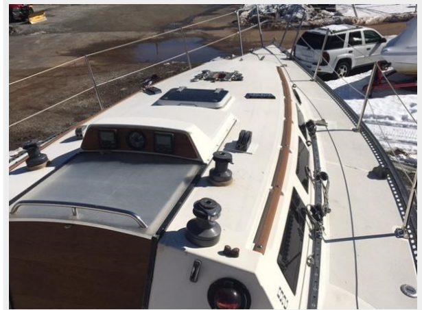
Pursuit Deck 1