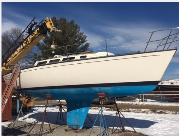
Pursuit Starboard Side