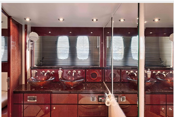
Master Ensuite 1