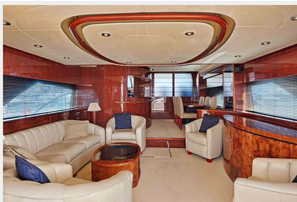
Main Salon 3