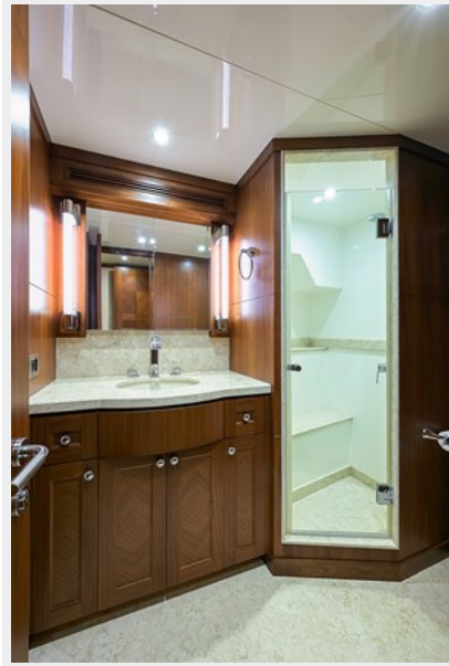
Wiggle Room_Forward Head1