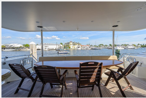
Wiggle Room_Aft Deck8