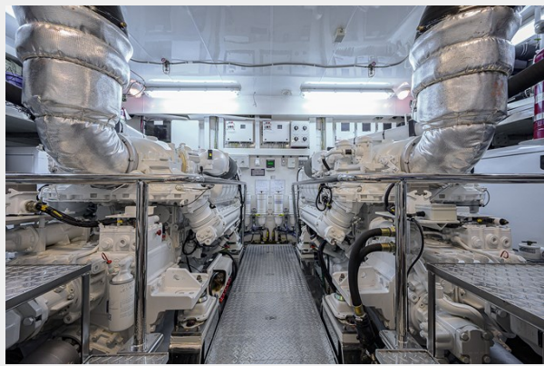
Wiggle Room_Engine Room1