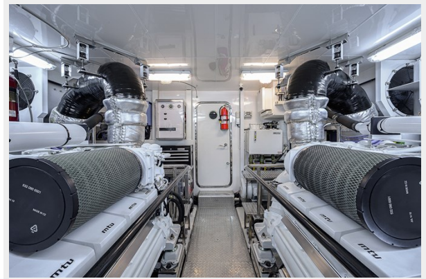
Wiggle Room_Engine Room4