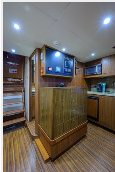
Wiggle Room_Crew Quarters2