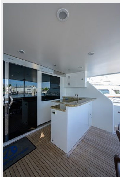
Wiggle Room_Aft Deck4