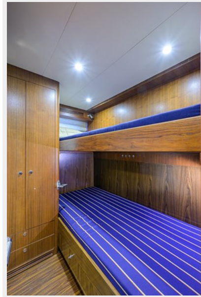
Wiggle Room_Crew Quarters7