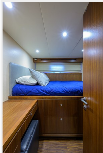
Wiggle Room_Crew Quarters4