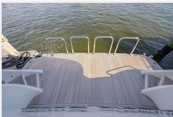
Wiggle Room_Swim Platform1