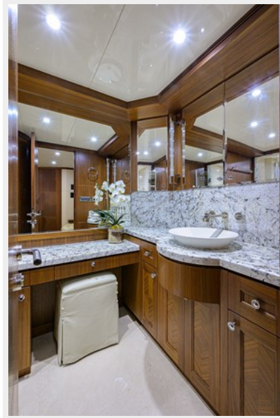
Wiggle Room_Master Head1