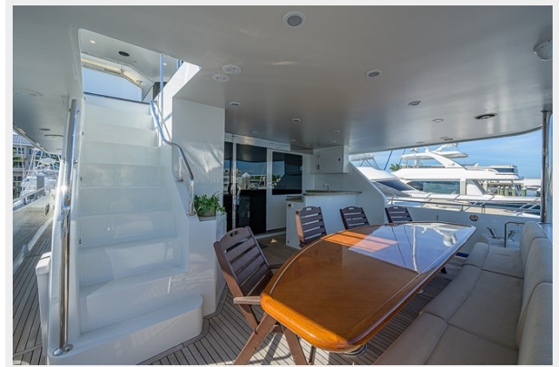
Wiggle Room_Aft Deck3