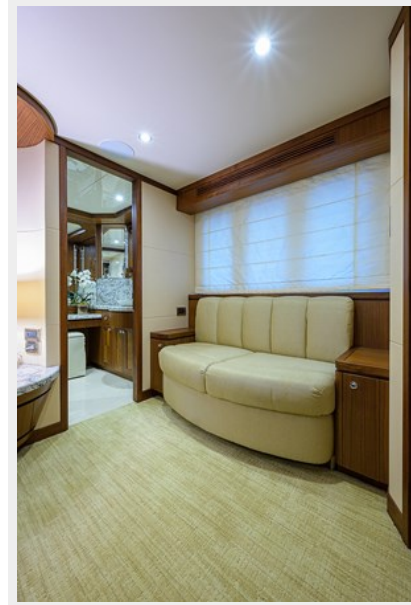
Wiggle Room_Master Stateroom8