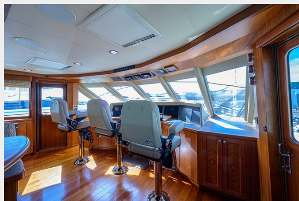
Wiggle Room_Enclosed Flybridge6