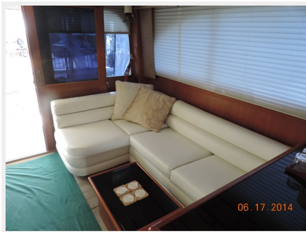
boss lady 2