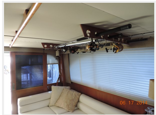
boss lady 3