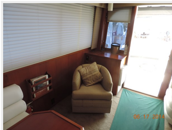
boss lady 4