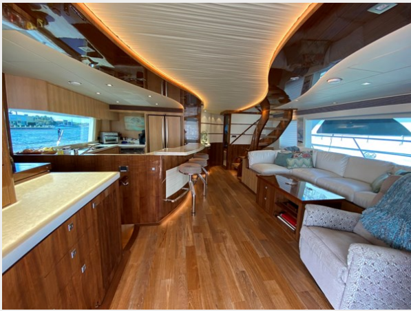
Salon Looking Fwd