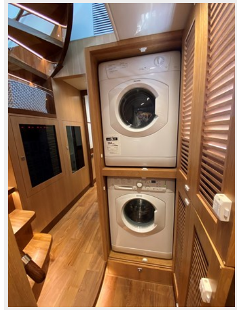
Washer and Separate Dryer