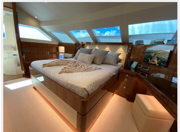
Master Stateroom 1