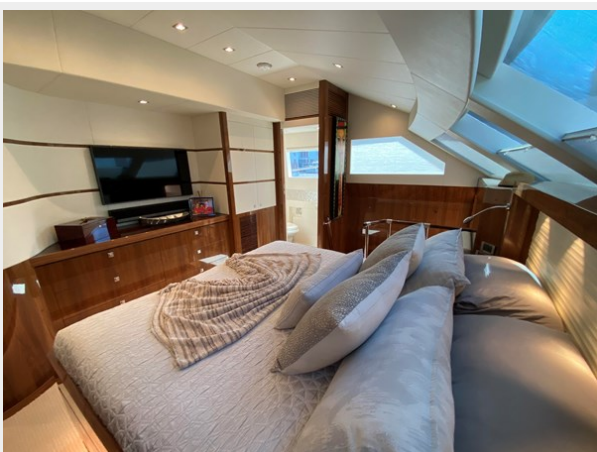
Head on Same Level