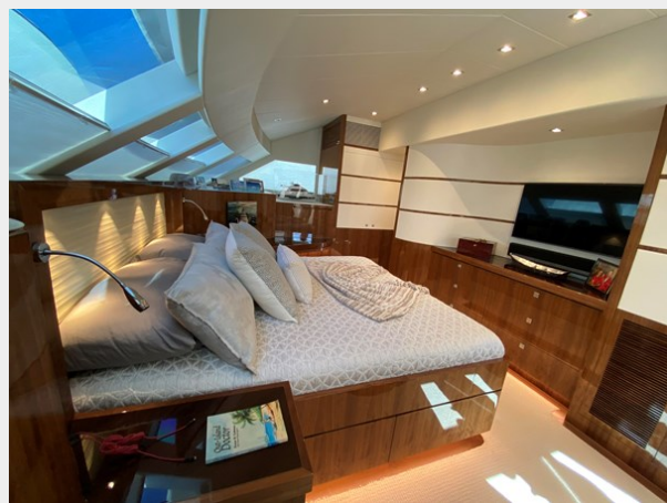
Master looking aft