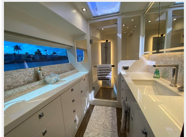
Shower And Vanity