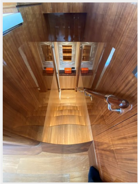
Stairwell to Twin Cabin