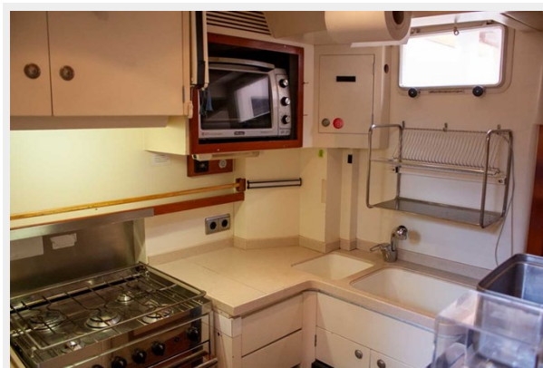
Fifty Fifty galley