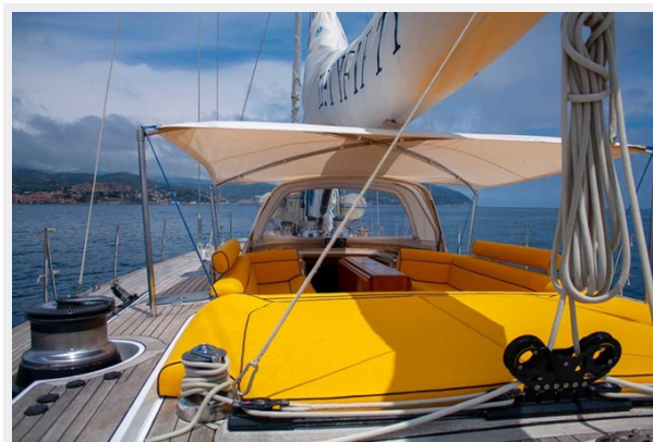
Fifty Fifty yacht deck