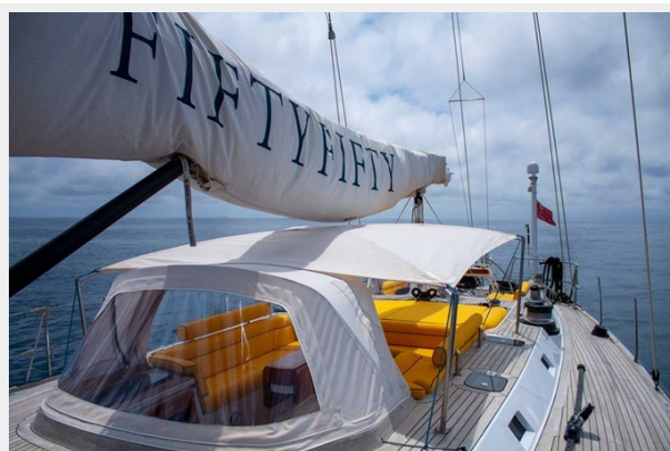
Fifty Fifty yacht boom