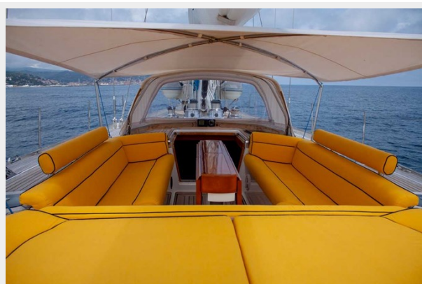
Fifty Fifty settee