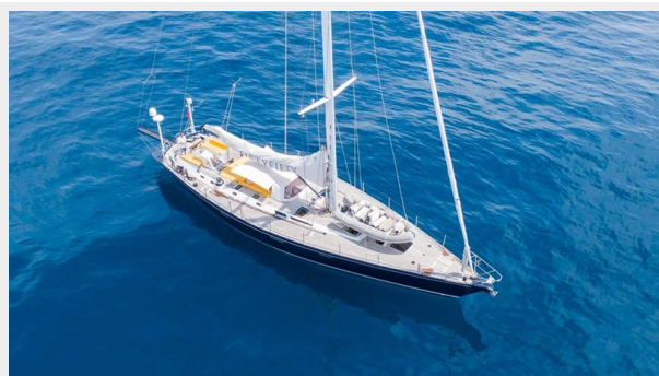
Fifty Fifty CNB yacht