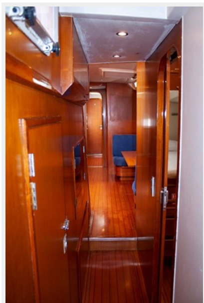
Fifty Fifty corridor