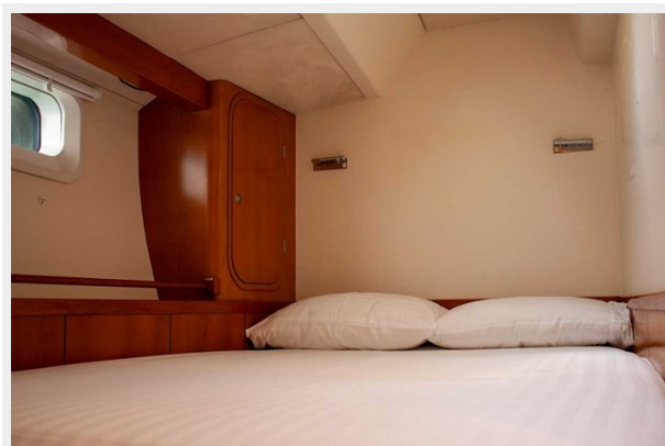
Fifty Fifty bed