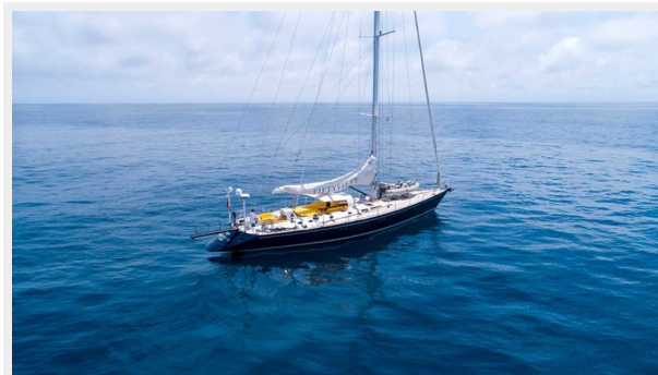
Fifty Fifty yacht sailing