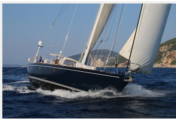
Fifty Fifty sailing