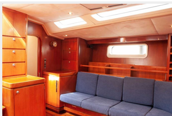
Fifty Fifty saloon