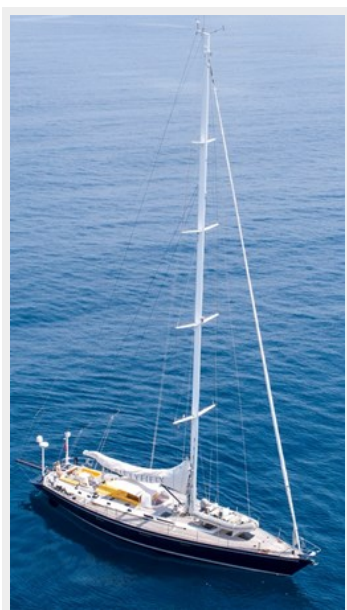
Fifty Fifty Construction Navale Bordeaux