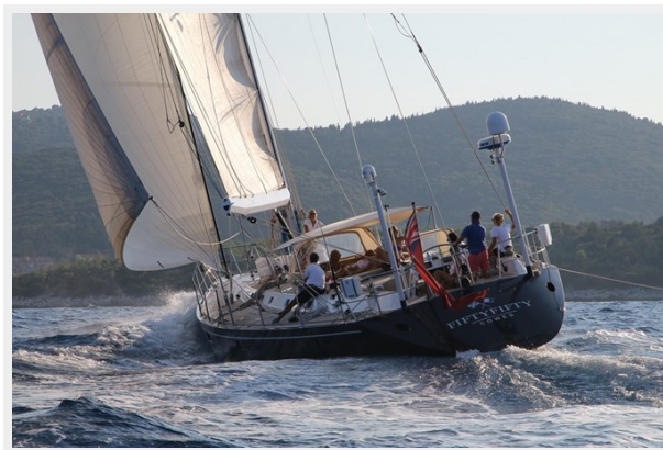
Fifty Fifty yacht at sea