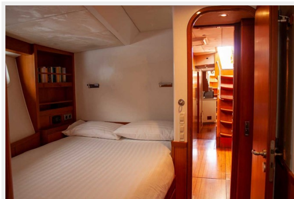
Fifty Fifty stateroom