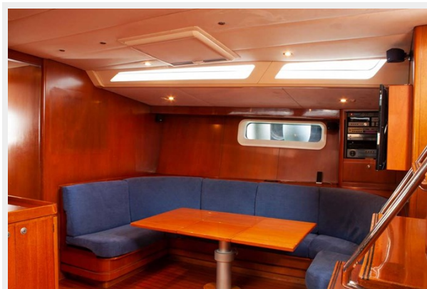
Fifty Fifty yacht dining table