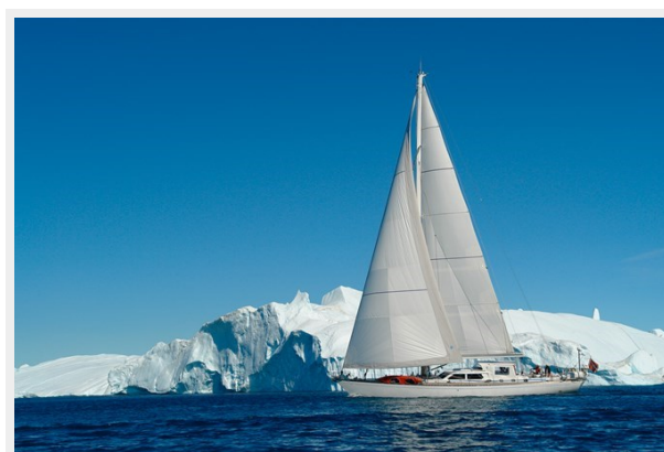
Plum at anchor