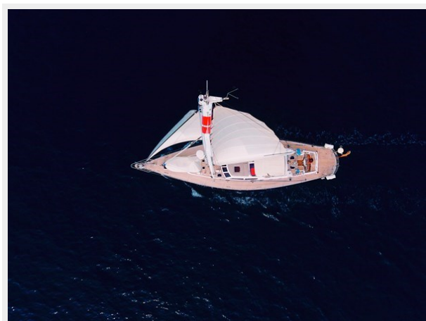
Plum yacht view