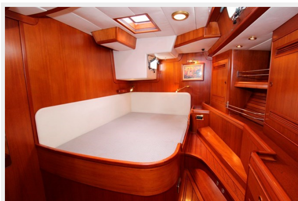
Plum yacht stateroom