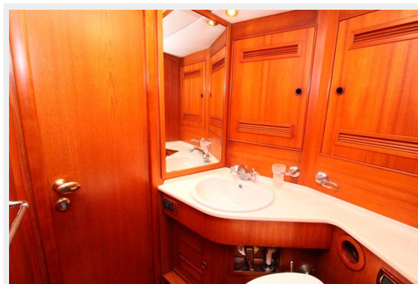
Plum yacht en suite