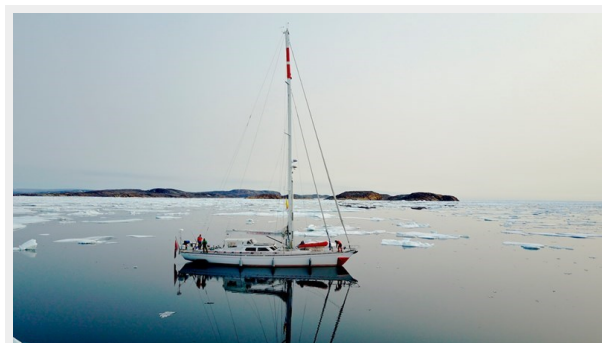
Plum sailing yacht