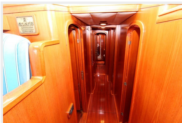
Plum yacht corridor