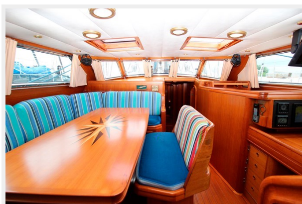
Plum yacht saloon