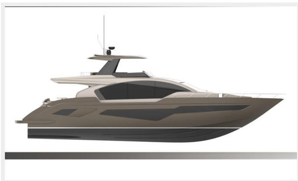
Full view SB