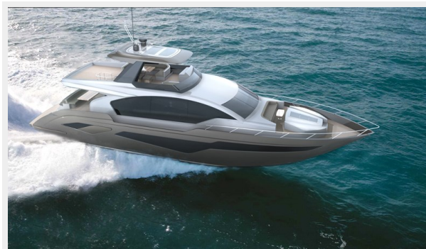
At speed bow