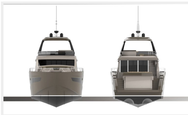
Bow & Stern view