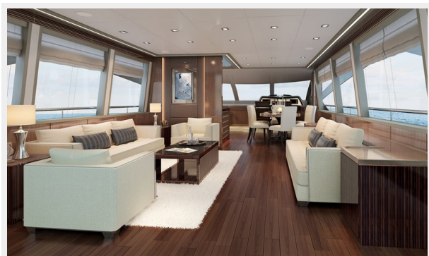
Lounge facing bow