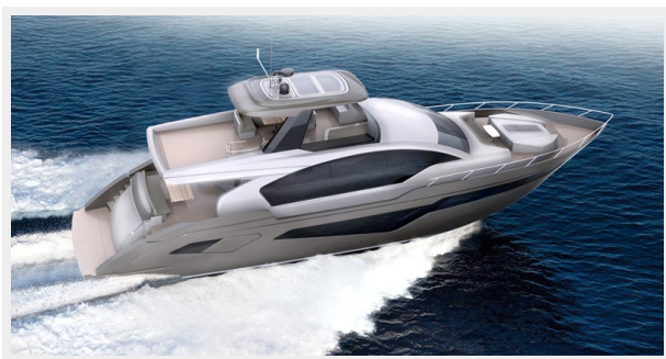
At speed stern