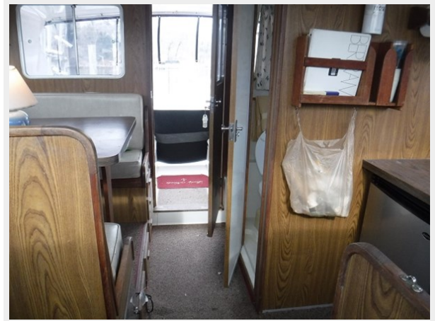
8 Salon Aft View