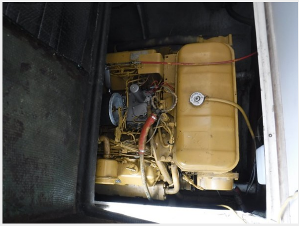
13 Cat 3208 Port