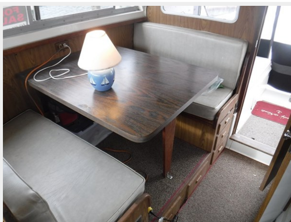
11 Salon Table