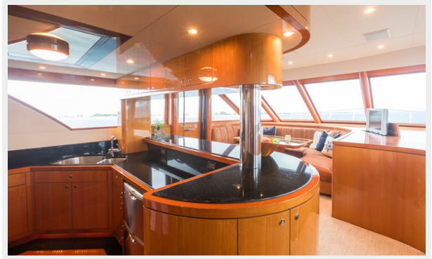
galley and settee