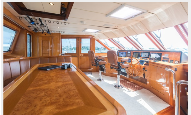
pilothouse and settee