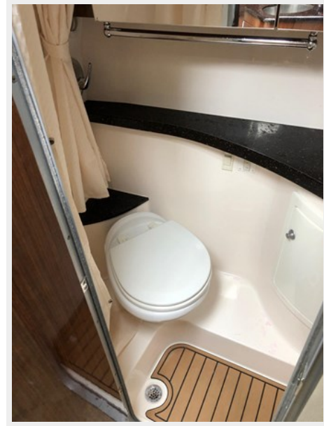
2014 REGAL 28 EXPRESS head picture