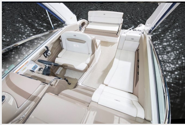
2014 REGAL 28 EXPRESS cockpit picture