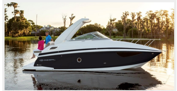
2014 REGAL 28 EXPRESS profile picture