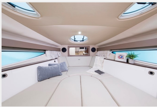
2014 REGAL 28 EXPRESS cabin bed down picture