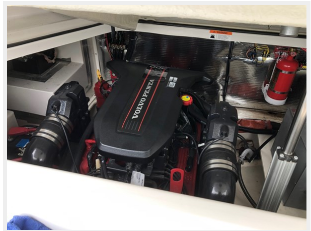
2014 REGAL 28 EXPRESS engine bay picture