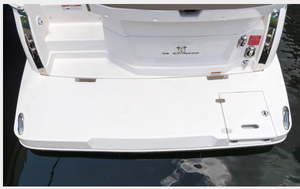
2014 REGAL 28 EXPRESS platform picture