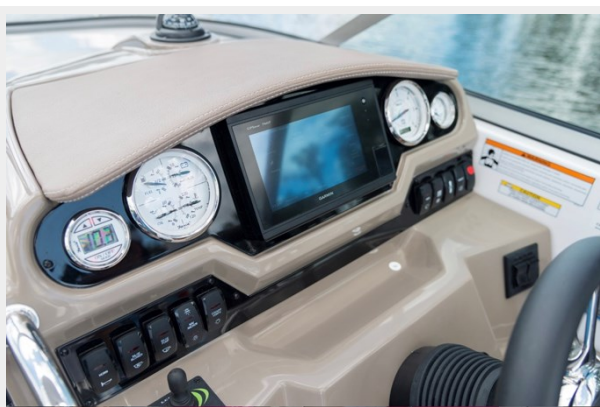
2014 REGAL 28 EXPRESS helm dash picture