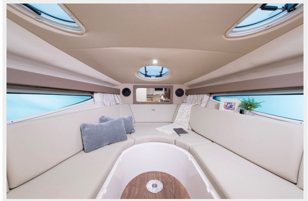
2014 REGAL 28 EXPRESS cabin bed up picture