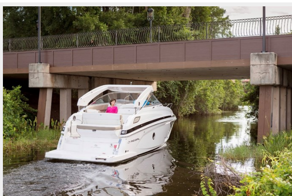
2014 REGAL 28 EXPRESS arch down picture