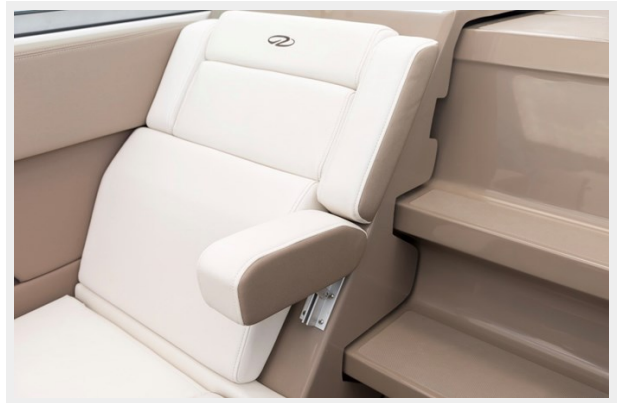
2014 REGAL 28 EXPRESS port armrest picture