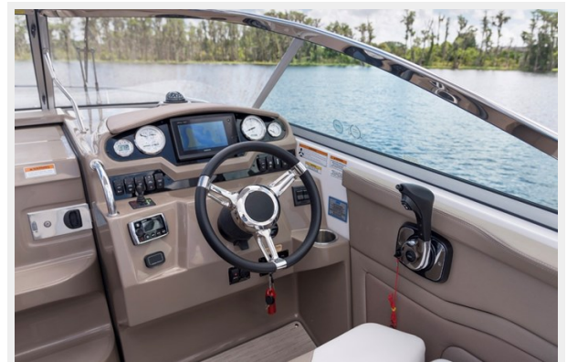
2014 REGAL 28 EXPRESS helm picture