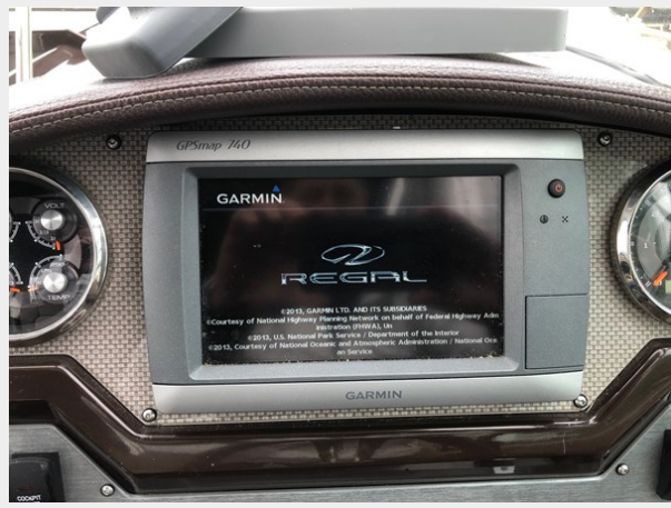
2014 REGAL 28 EXPRESS GPS picture