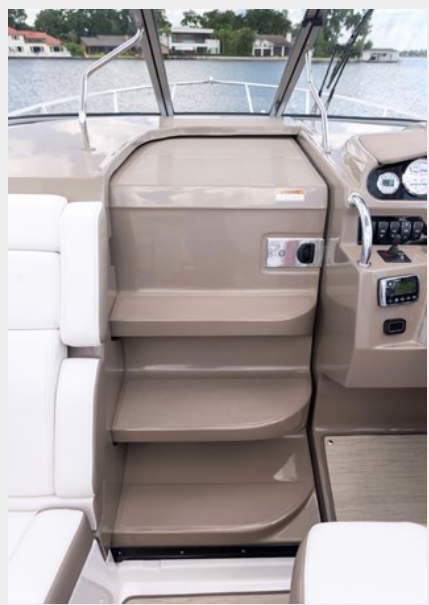
2014 REGAL 28 EXPRESS door steps picture