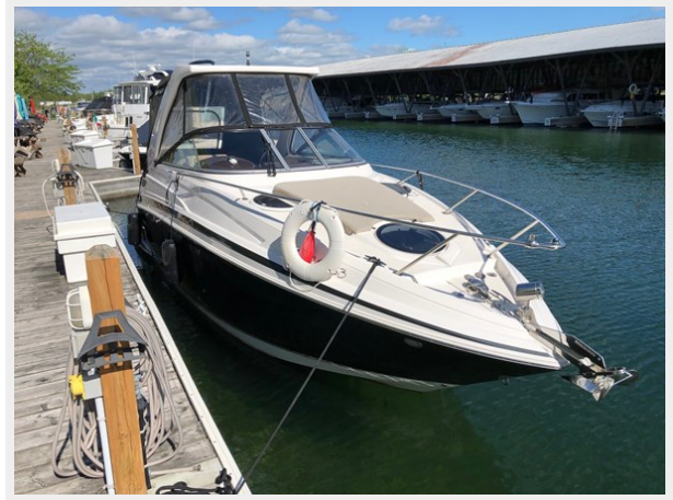
2014 REGAL 28 EXPRESS stbd bow picture