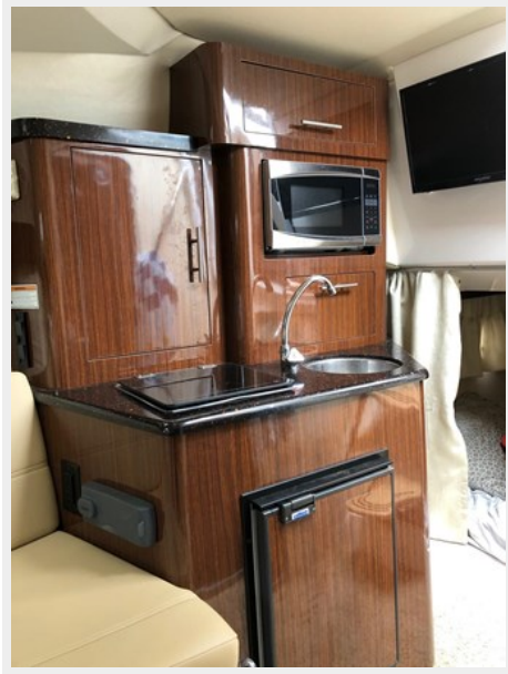
2014 REGAL 28 EXPRESS actual picture