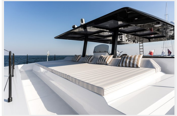
Sunreef 68 Power Yacht For Sale 1-min