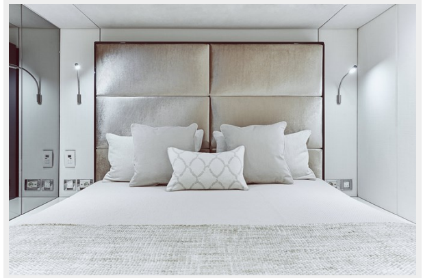
Sunreef 68 Power Yacht For Sale 27-min