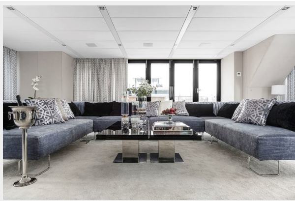
Sunreef 68 Power Yacht For Sale 30-min