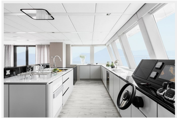
Sunreef 68 Power Yacht For Sale 26-min