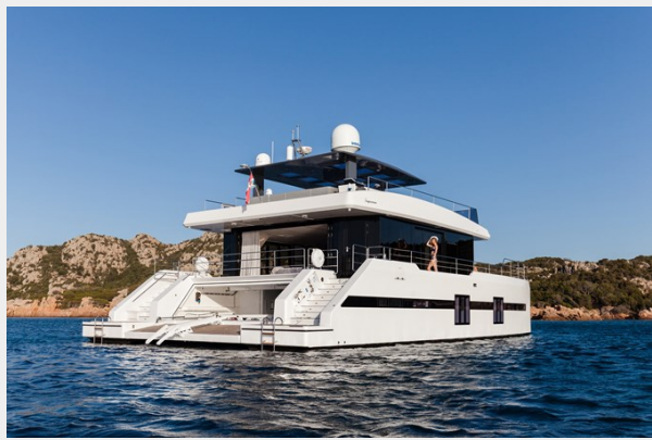
Sunreef 68 Power Yacht For Sale 4-min