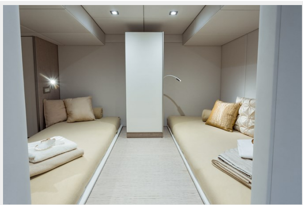
Sunreef 68 Power Yacht For Sale 22-min