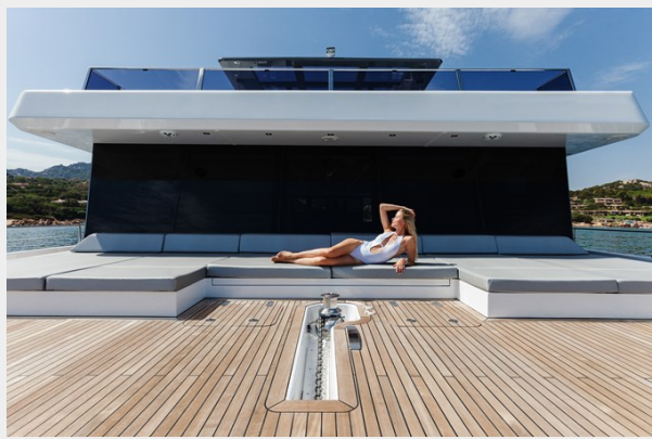
Sunreef 68 Power Yacht For Sale 11-min