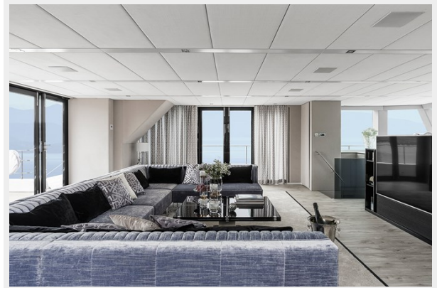
Sunreef 68 Power Yacht For Sale 25-min