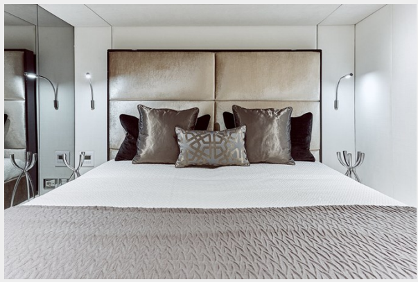
Sunreef 68 Power Yacht For Sale 28-min