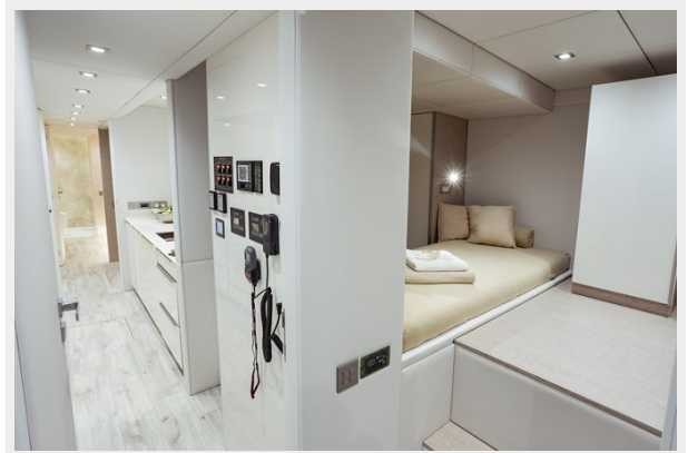
Sunreef 68 Power Yacht For Sale 23-min