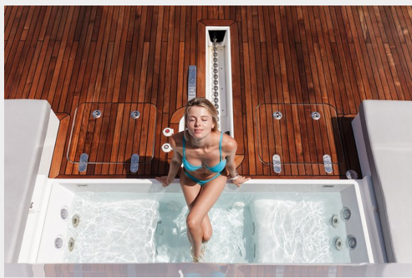
Sunreef 68 Power Yacht For Sale 10-min