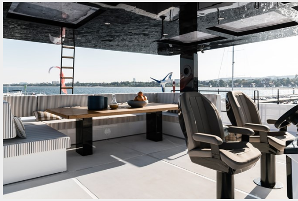
Sunreef 68 Power Yacht For Sale 2-min