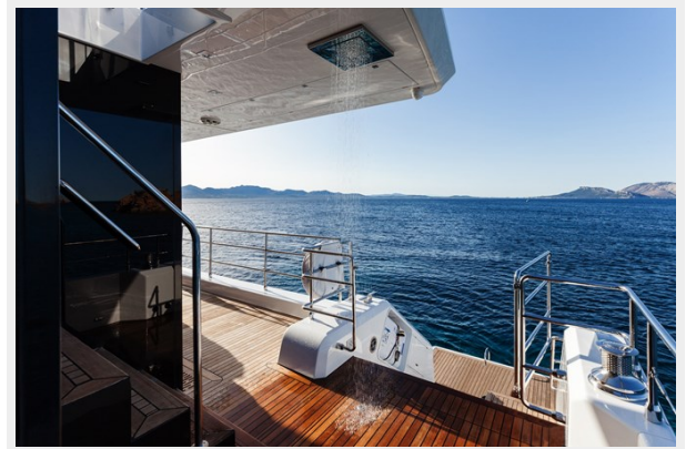
Sunreef 68 Power Yacht For Sale 7-min