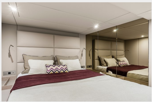
Sunreef 68 Power Yacht For Sale 12-min