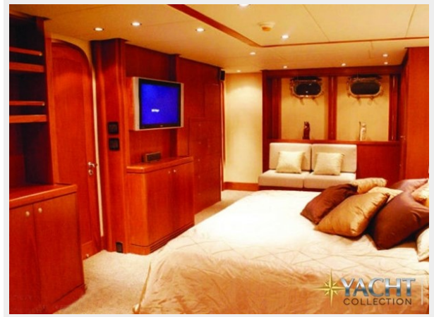
12.Victoria A_master str2