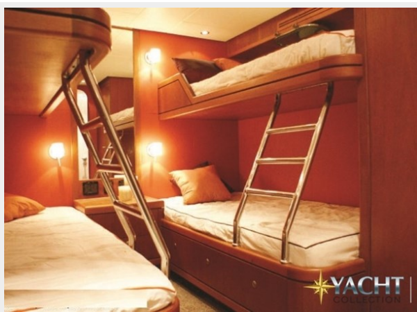
13.Victoria A_guest str2