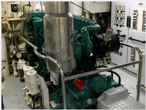
20.Victoria A_engine room2