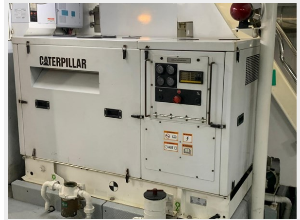
20.Victoria A_engine room3