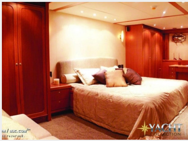
12.Victoria A_master str1