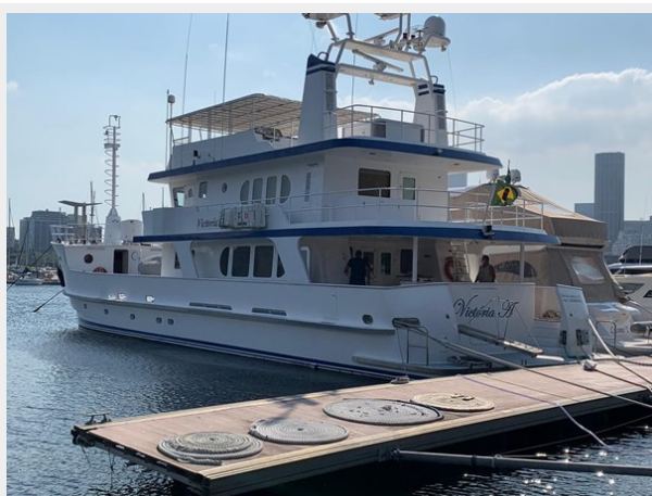
3.Victoria A_ aft1