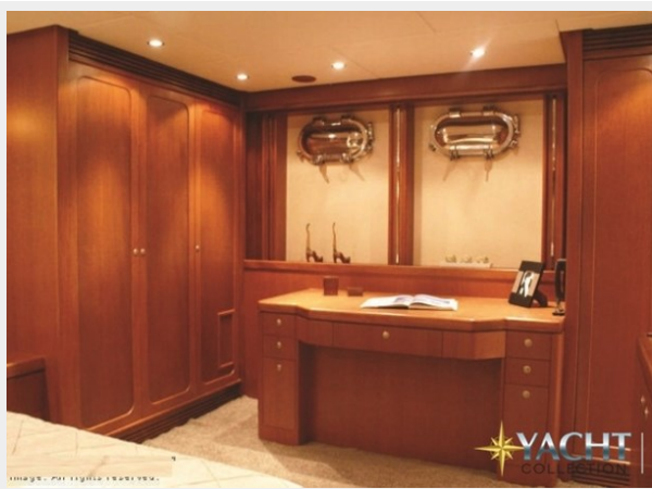
12.Victoria A_master str3