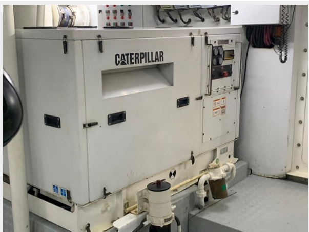
20.Victoria A_engine room4