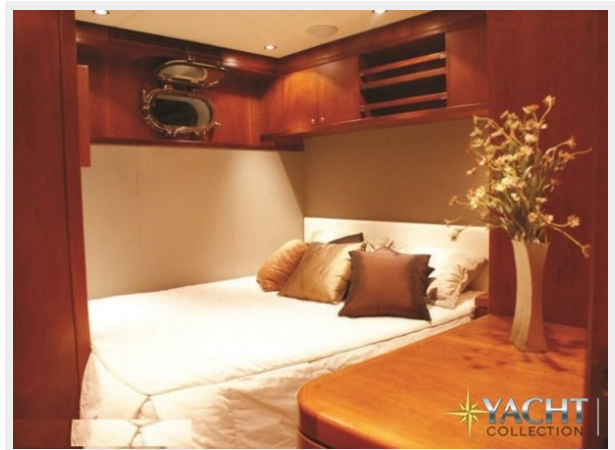
13.Victoria A_guest str1