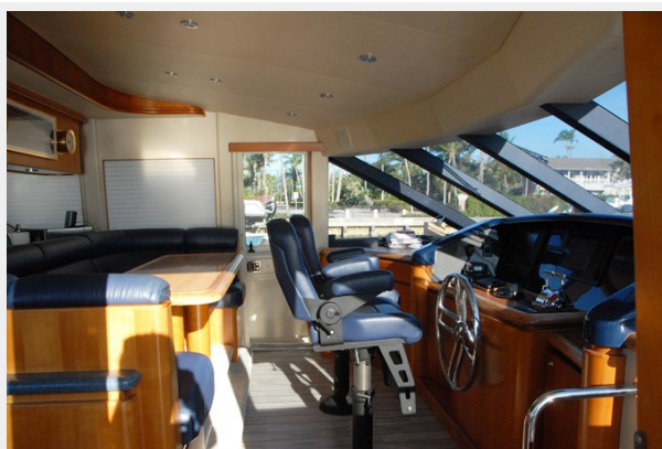
Pilothouse opens to galley with seating for 7