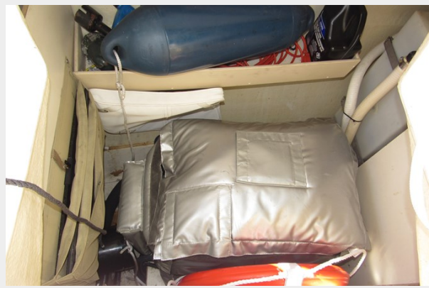
Cockpit storage and generator cover