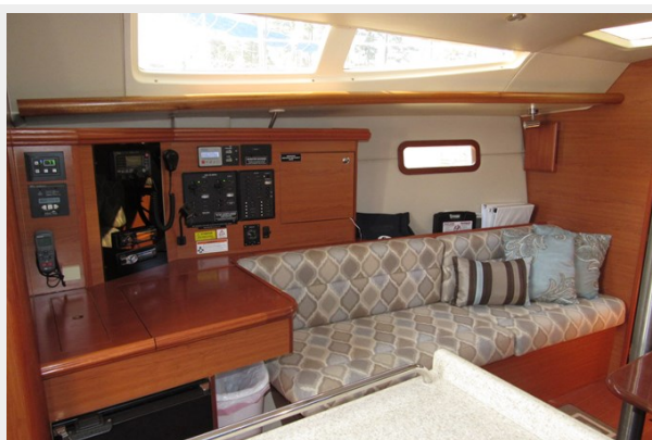
Port settee and nav station