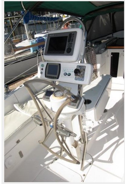
Folding wheel and pedestal