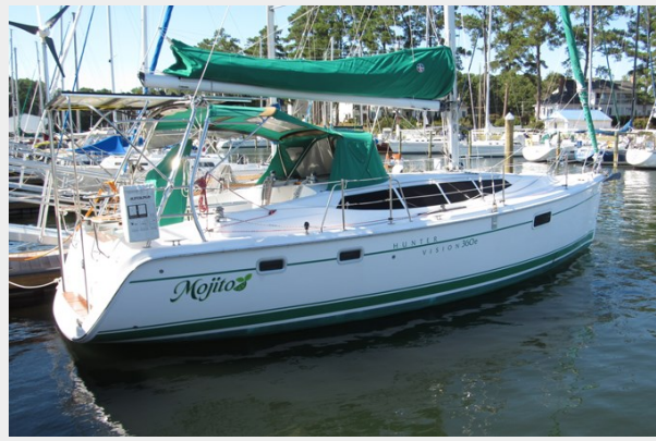
Mojito on the dock