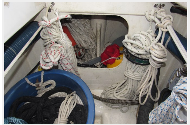
Storage under cockpit floor