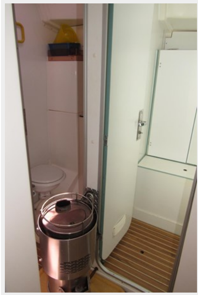
Heater, access to starboard forward head and cabin