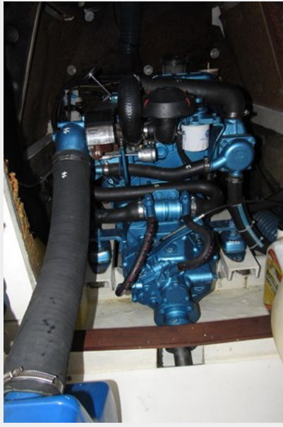
Engine - under cockpit floor