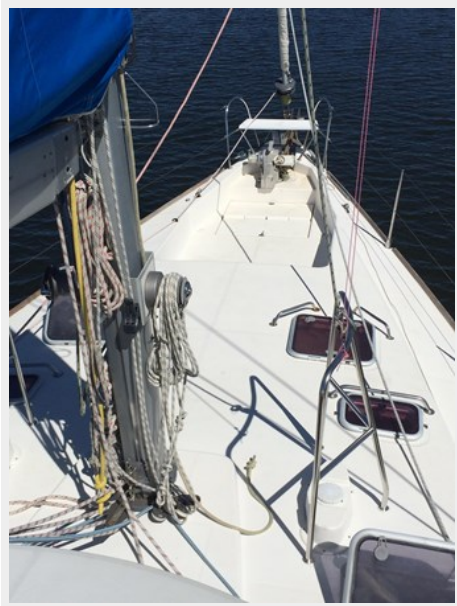
Foredeck from top of coachroof