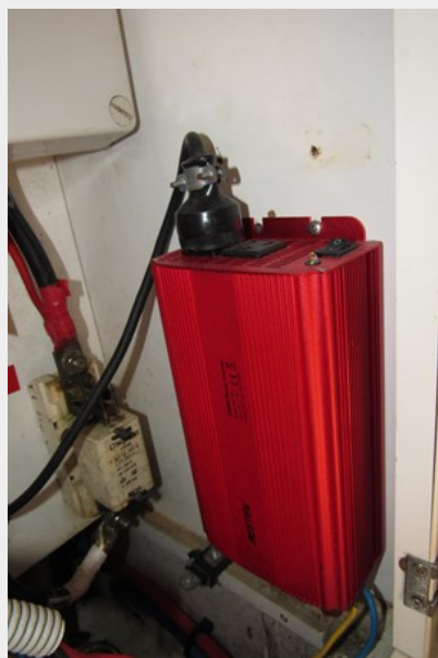
1000 W inverter