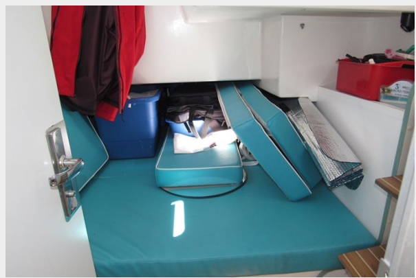
Starboard aft cabin