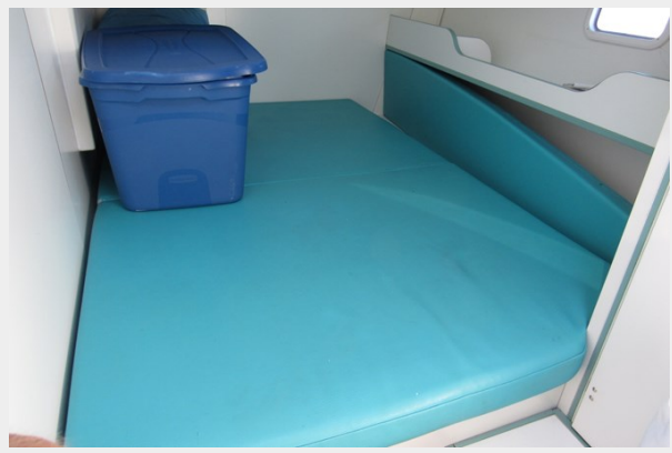
Port Forward cabin