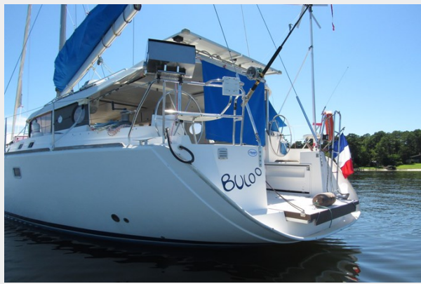
Stern with transom down