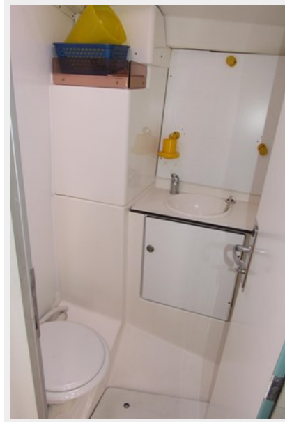
Starboard forward head