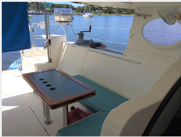
Port cockpit table and settee