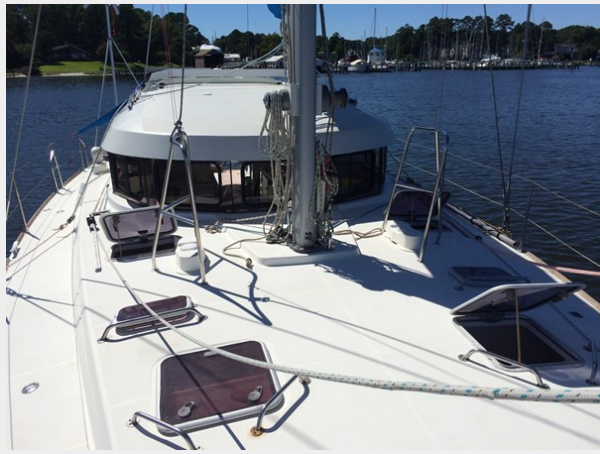
Deck and coachroof, looking aft