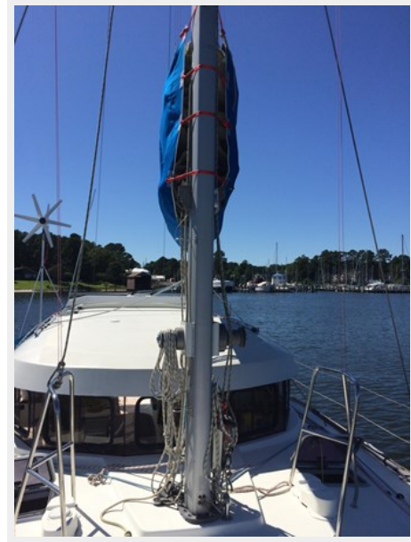
Mast and windows in coachroof