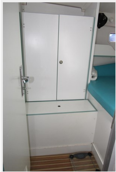
Storage starboard forward cabin