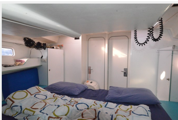
Forward cabin looking aft