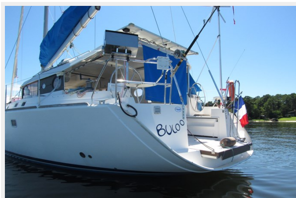
Stern with transom down