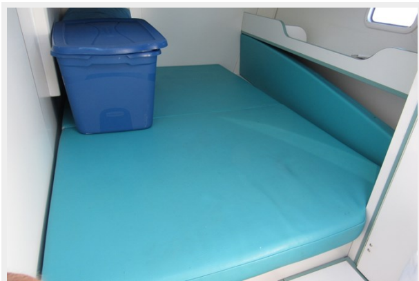
Port Forward cabin