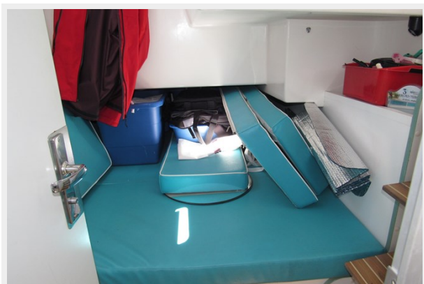
Starboard aft cabin