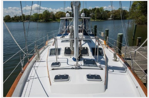
DECK VIEW AFT