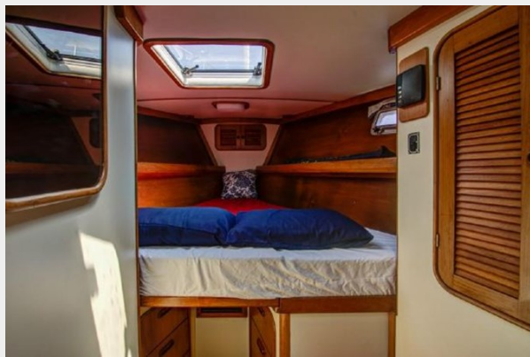
GUEST CABIN 2 FWD