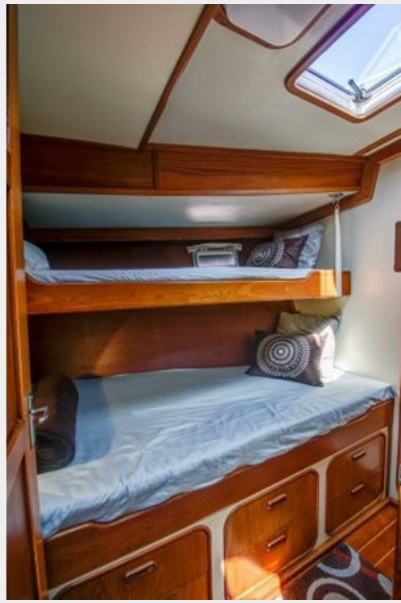
GUEST CABIN 1, PORTSIDE