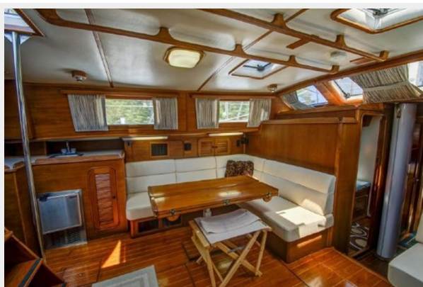
PORT SIDE MAIN SALOON