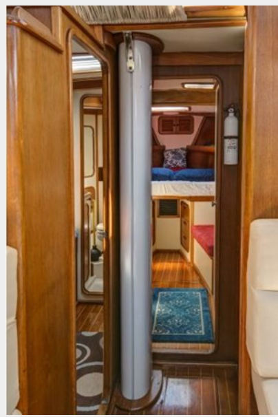
VIEW FORWARD FROM SALOON