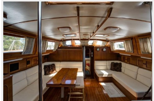
MAIN SALOON FWD