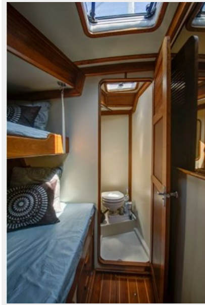
GUEST CABIN W/HEAD, FWD