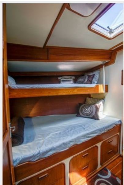
GUEST CABIN 1, PORTSIDE