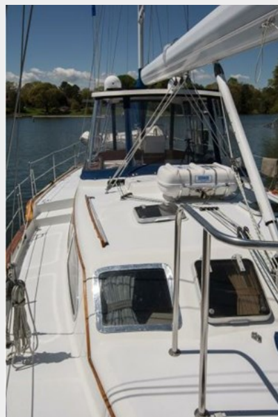
HARDTOP AND ENCLOSURE