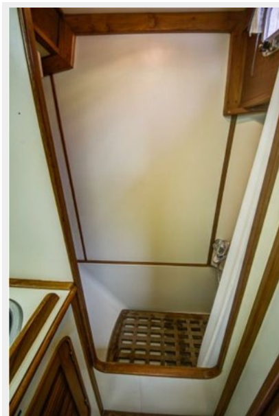
OWNER'S CABIN HEAD, SHOWER STALL