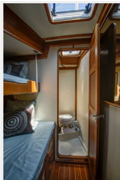
GUEST CABIN W/HEAD, FWD