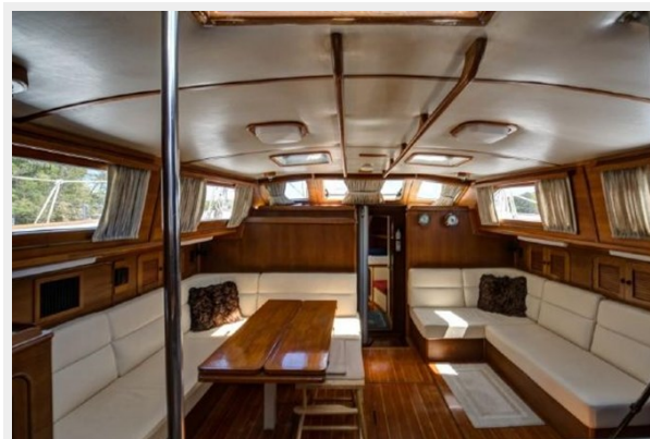
MAIN SALOON FWD