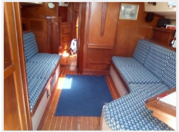
Main Saloon from the companionway