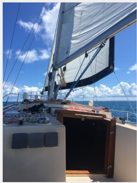
LOLA under sail