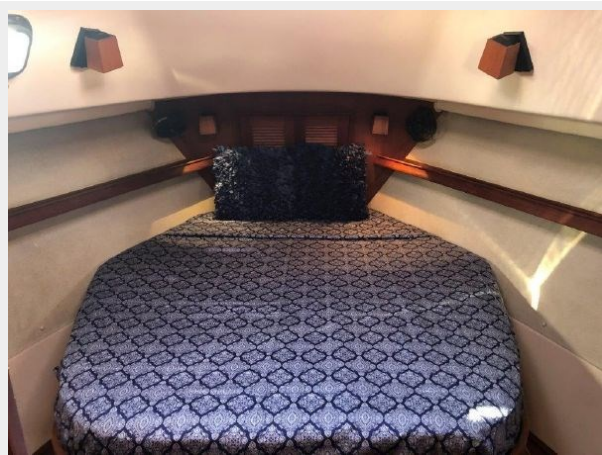
Double island berth in the forward stateroom