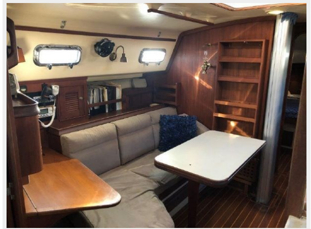
Dining table and storage