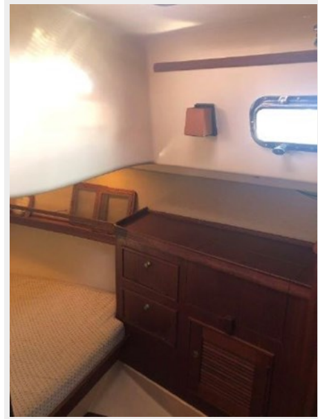
Aft stateroom storage