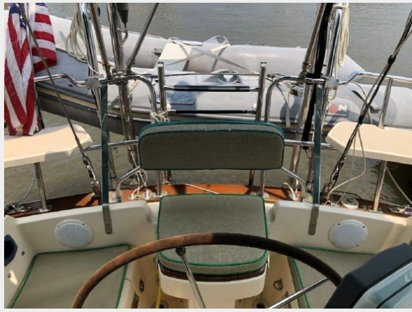
Helm seat with removable back