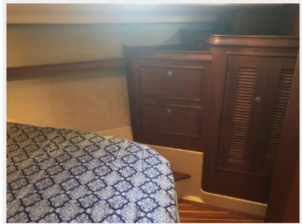
Fwd stateroom starboard storage