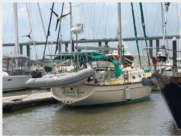
Sugar Scoop Transom