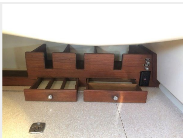
Plate and cutlery storage