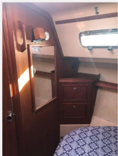
Fwd stateroom port storage