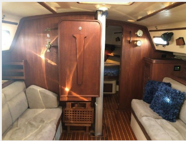
Fold up table and a small coffee table