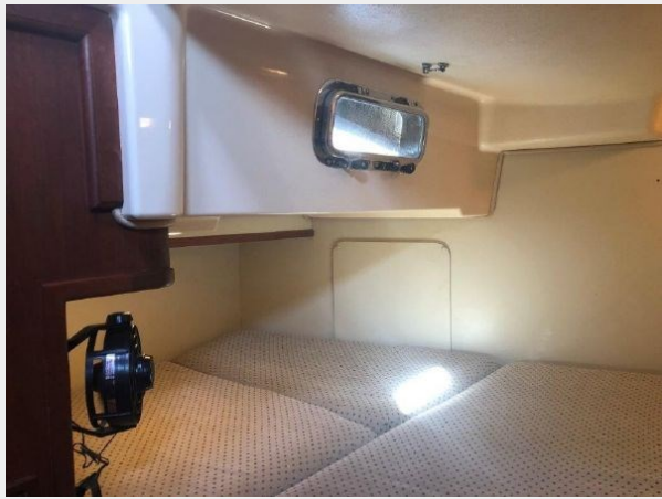
Aft stateroom berth