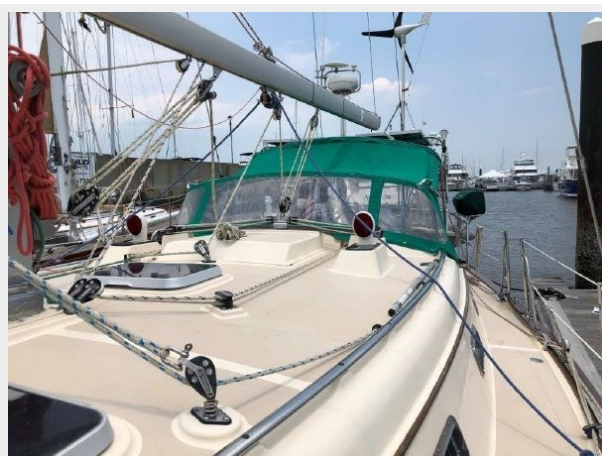
Self tending staysail w/Hoyt Boom