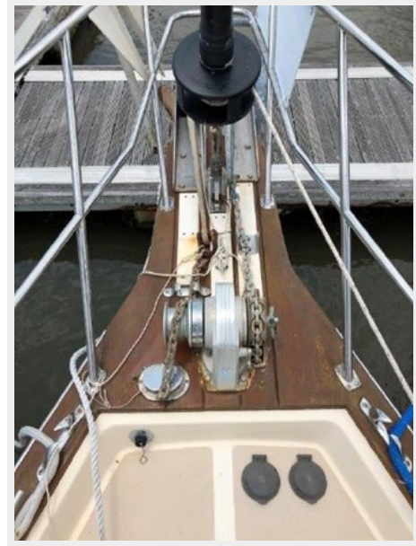
Three anchors, two rollers and a windlass