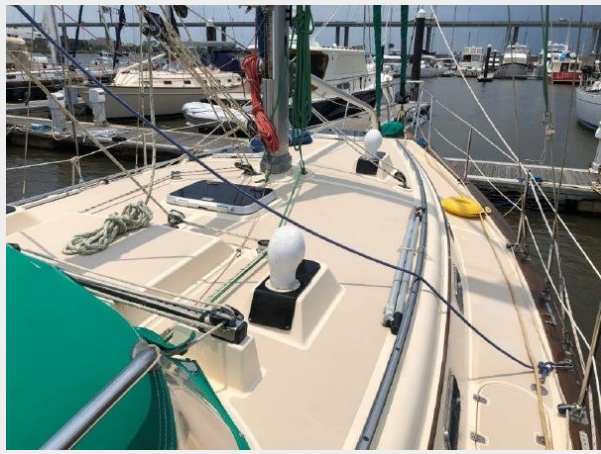
Wide side decks with stainless steel handrails