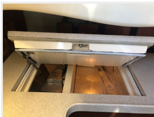
Refrigerator and freezer