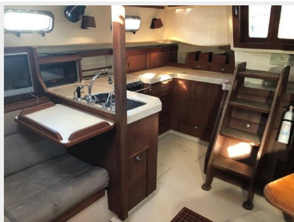
Galley and a folding table