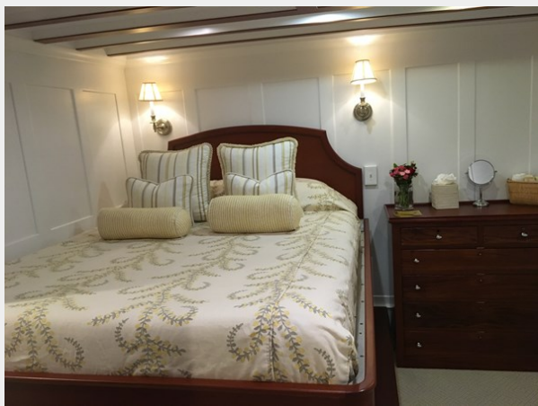
Guest Queen Stateroom