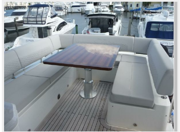
Aft Bridge Seating