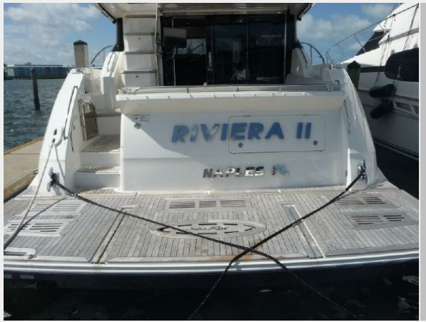
Hyd. Marine lift and swim platform