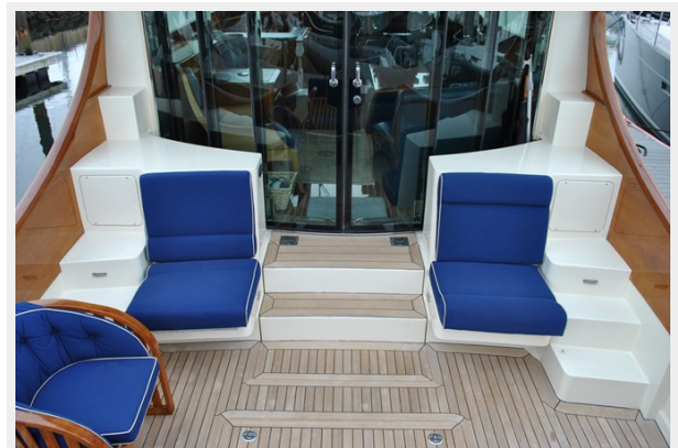
Aft Deck with Sliding Doors