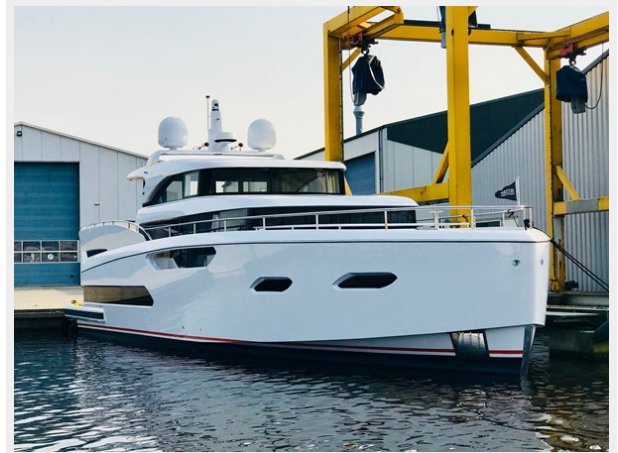
JE62B01 - image launch & trail- (3)