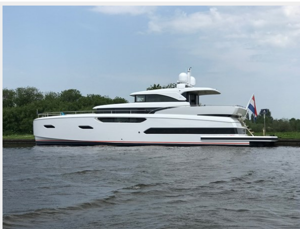
JE62B01 - image launch & trail- (8)