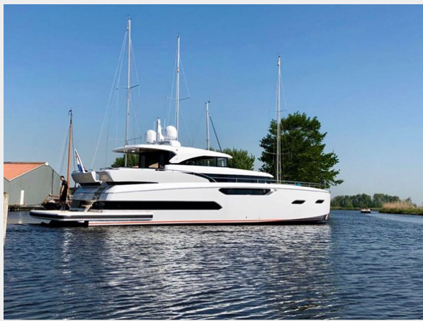
JE62B01 - image launch & trail- (1)