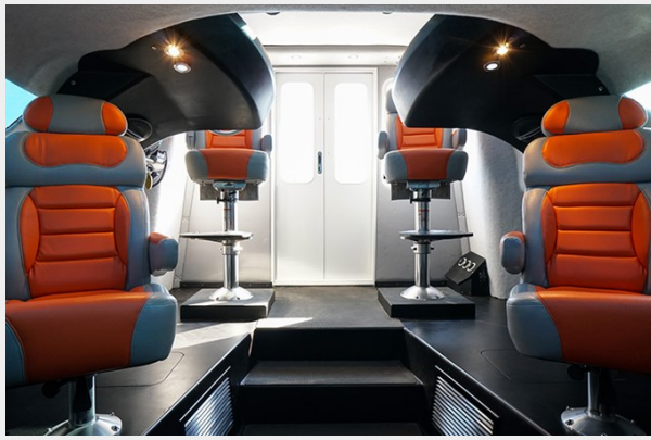
Cabin Looking Aft