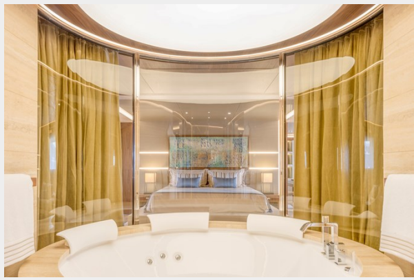
Main Deck - Owner cabin - Jacuzzi