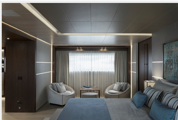
Main Deck - Owner Cabin 2