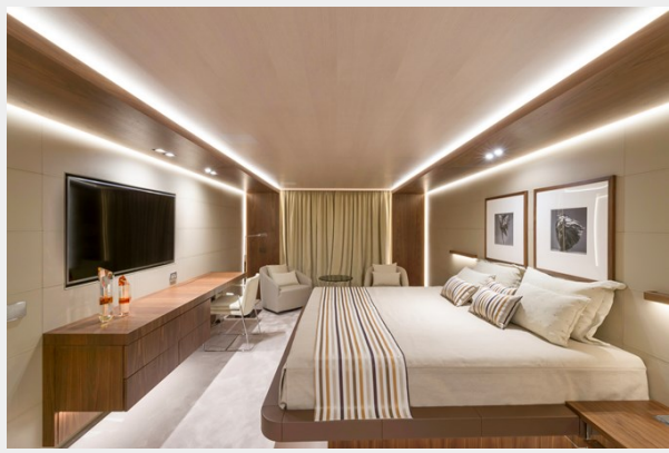
Lower Deck - Vip Cabin