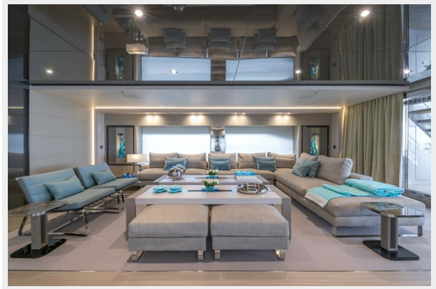
Upper Deck - Cinema Salon