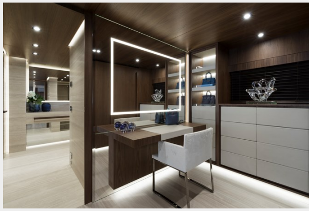
Main Deck - Owner Cabin - vanity