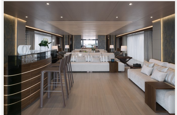
Main Deck - Main Salon 2