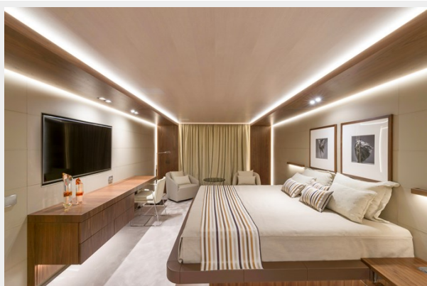
Lower Deck - Vip Cabin