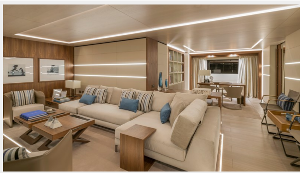
Main Deck - Owner salon and studio