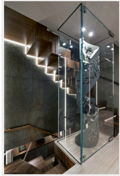
Main Deck - Staircase lobby