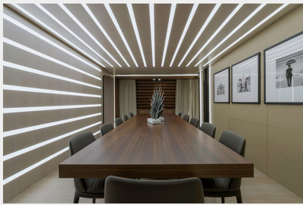
Main Deck - Dining Room