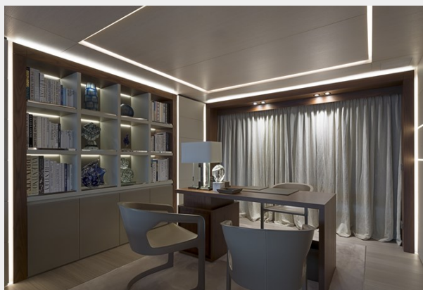
Main Deck - Owner studio