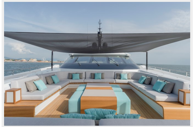
Upper Deck - Fwd Cockpit