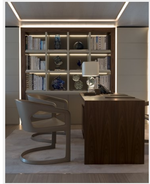
Main deck - Owner studio 2