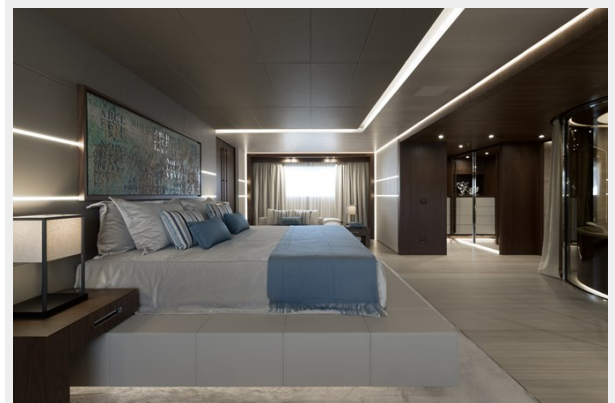
Main Deck - Owner Cabin 1