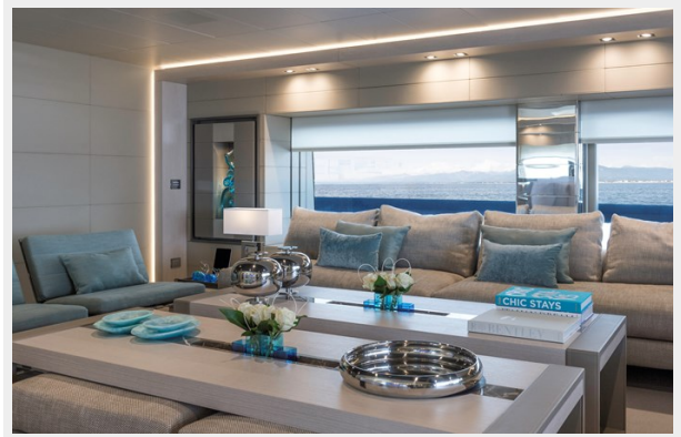
Upper Deck - Cinema Salon 2