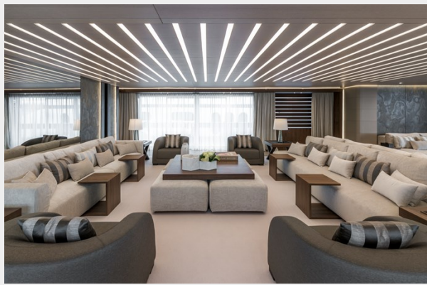
Main Deck - Main Salon 3