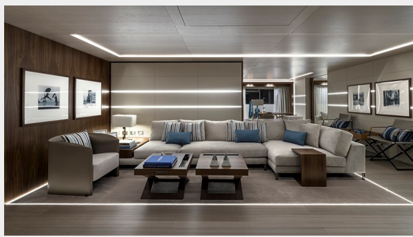
Main Deck - Owner salon