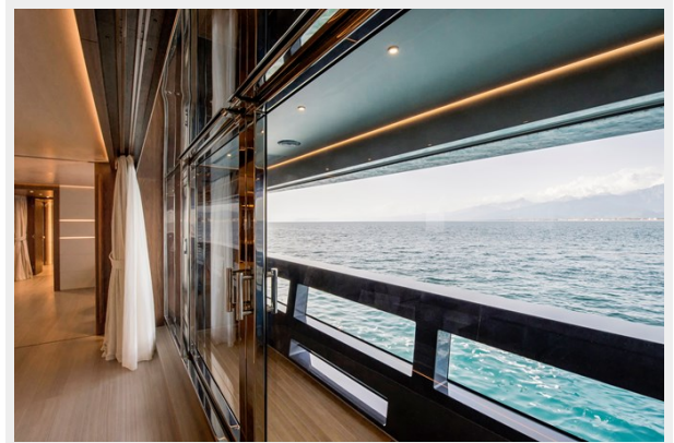
Main Deck - Owner Cabin - Balcony