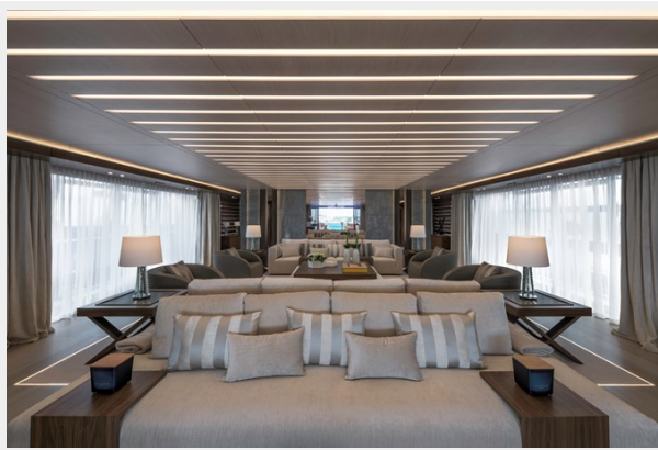
Main Deck - Main salon