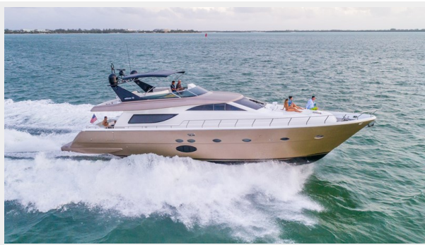
72' Uniesse Gold Cruising