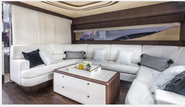
72' Uniesse Salon