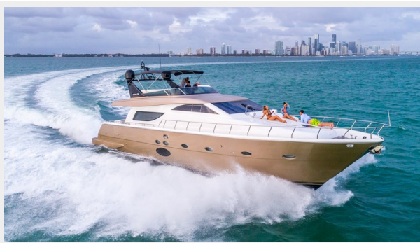
72' Uniesse Cruising