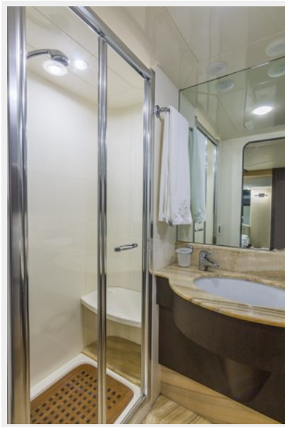
72' Uniesse Head