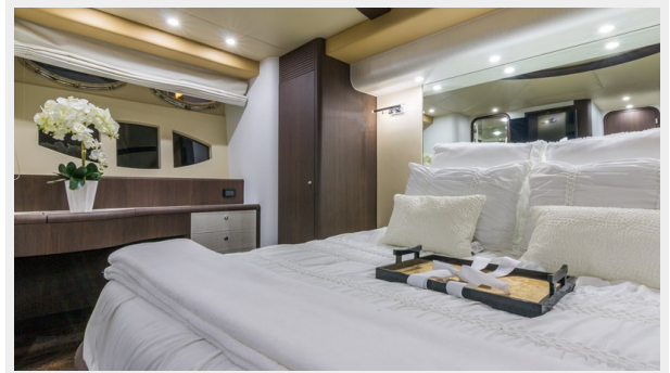
72' Uniesse Master Suite