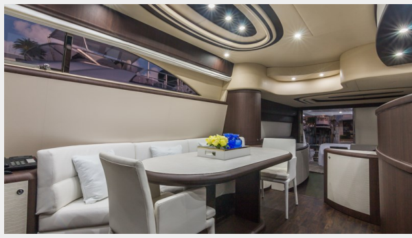
72' Uniesse Main Salon Dining Table