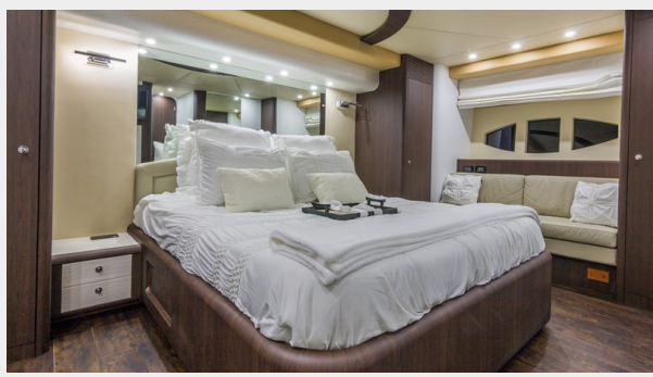
72' Uniesse Bedroom