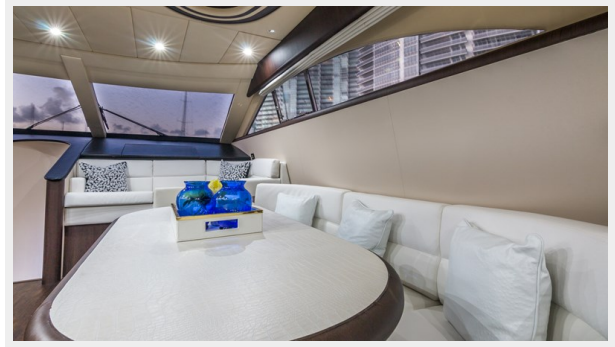
72' Uniesse Dining Table