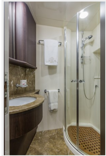
72' Uniesse Head