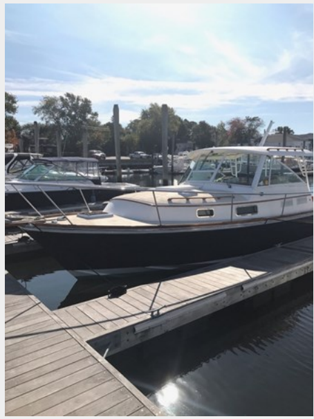
2_2001 29ft Bruckmann Bluestar 29.9 GYPSY