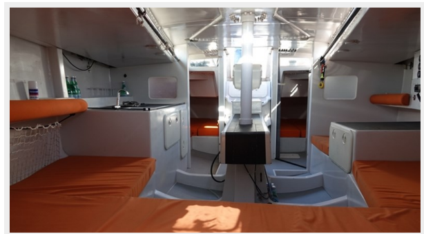
BLACK_LEDEND 2_sailing yacht_black_pepper_code_1_005