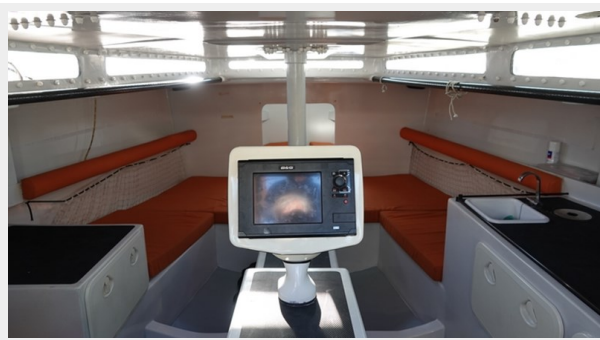
BLACK_LEDEND 2_sailing yacht_black_pepper_code_1_004