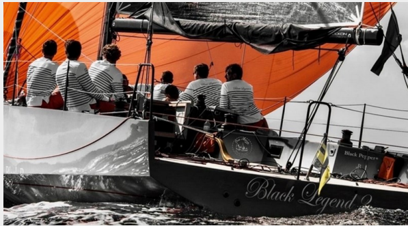
BLACK_LEDEND 2_sailing yacht_black_pepper_code_1_004