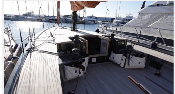
BLACK_LEDEND 2_sailing yacht_black_pepper_code_1_003