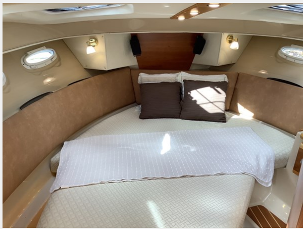
11 Master Stateroom