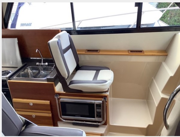
7 Custom Mate Seat