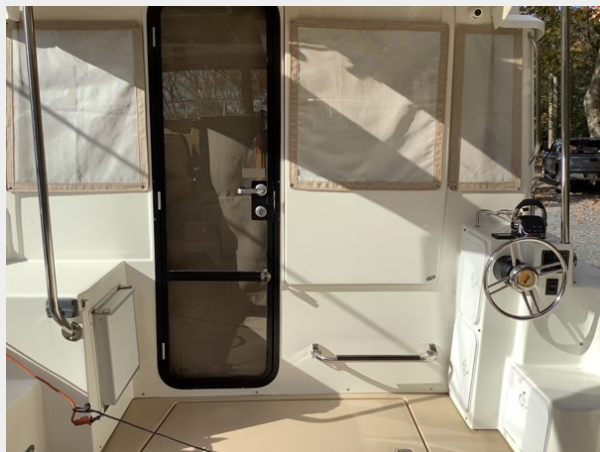
22 Cockpit Covers 2