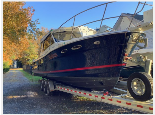
6 Bow Trailer