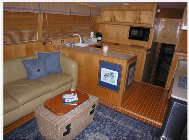
Salon / Galley